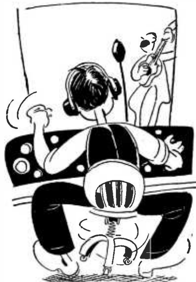
"They say he goes home and plays his own recordings."