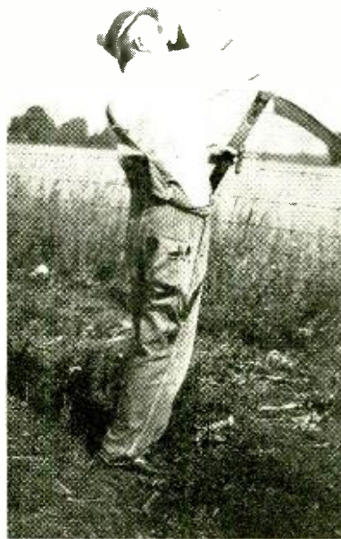
The Latch String proprietor has an expert water-jug technique which bespeaks many years of work under the hot sun.