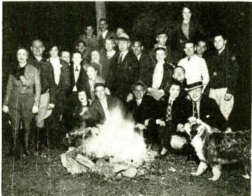
THE BEST PART of the ride at Stanton's farm for lots of the gang is the big steak fry and bon fire that follows. Boots, the English Shepherd dog, appreciates it, too.