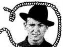
Rambling Red Foley