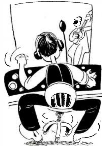
"If only I could persuade Joe Louis to take over my job five minutes."

ROLL DEVELOPED AND 16 GUARANTEED PRINTS 116 Size or smaller, 25c in Coin. SMART PHOTO SHOP Winona, Minnesota