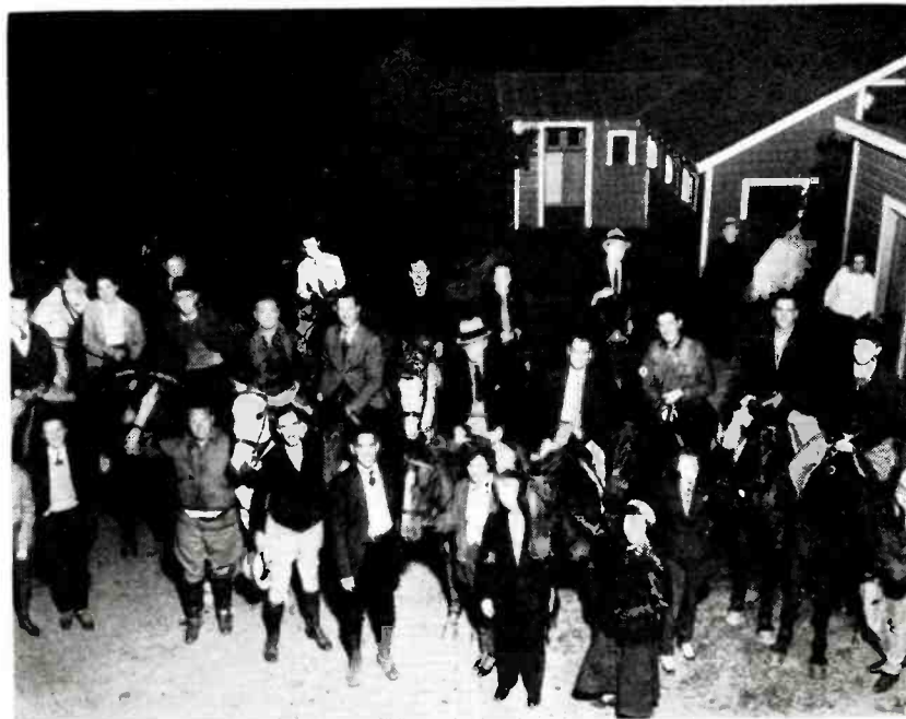
AMBITIOUS equestrians and equestriennes forget radio for a time to take a moonlight ride at Stanton's farm, Glen Ellyn, Ill. How many of your friends do you suppose took their meals off the mantel next day? Well, plenty of 'em.