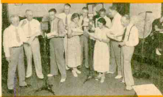
History lives again.