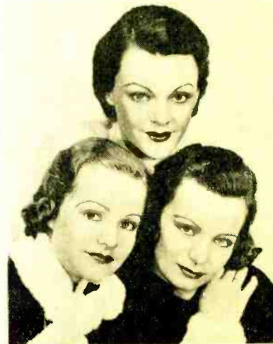
THE PICKENS SISTERS bring their rare harmony to the Evening in Paris program each Monday night at 7:30 through NBC-WLS.