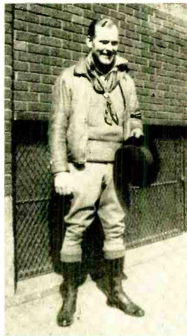
THE ARKANSAS WOODCHOPPER was all set to leave on a road tour but he stopped to pose for Frances O'Donnell's camera.