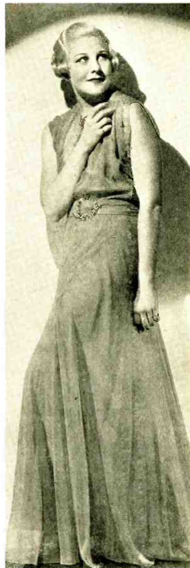
It's a grand gown for dancing.

When I go to a supper club after the theatre, I sometimes wear the delph blue chiffon evening gown pictured here. Because of the full skirt rustling over a taffeta slip, it's grand for dancing. The wire belt