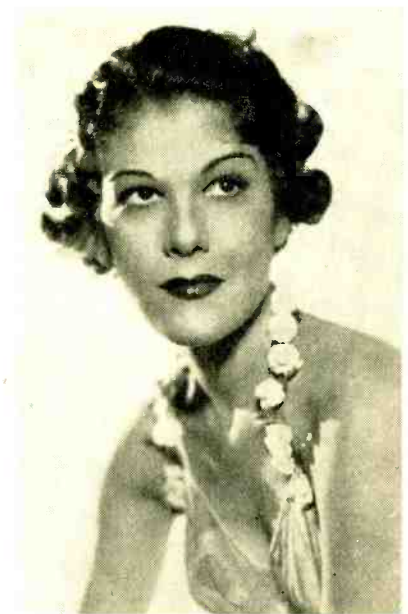
She wants her gowns dramatic.

Clinching her statement with actual proof, the young actress has ac-