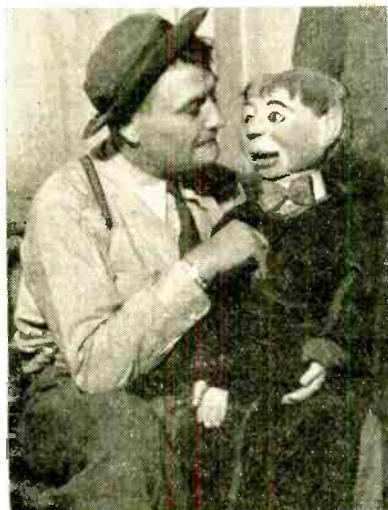
"Scully, have you been a good boy?"