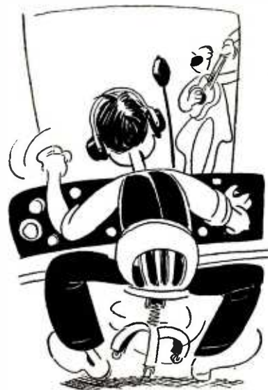
"If she could see him, she'd never come 'round the mountain."

P. S., Wednesday. When you phoned me at nine o'clock this morning at the cottage you got me out of bed to answer the call. I had only 10 hours sleep as a result. How would you like to have 10 hours sleep? It's great stuff. Try it some time. I'm really getting caught up.