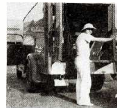
Tommy Rowe, at the rear of the station's new mobile transmitter truck, shows what the well-dressed young radio engineer will be wearing in the line of hat styles.