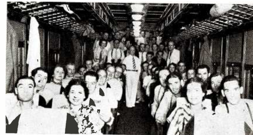
Here is a large group of your friends just after they boarded the steam cars for the trip to Springfield and the Illinois State Fair. Air conditioning in their private car made them forget torrid temperatures outside. We can't dope out a way to print all the identifications under this cut, so we'll see how many you can call by name.