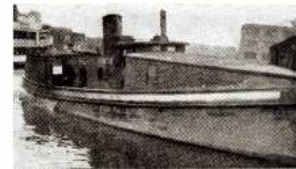
A view of the Dad Ludwig.