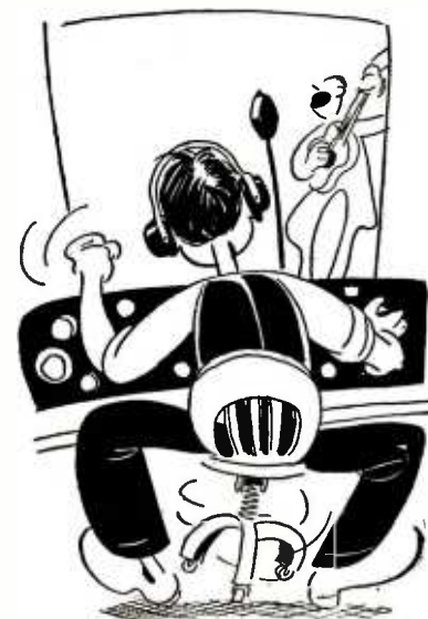
"I certainly get tired of looking down in the mouth six days a week."

Fred used to be an amateur himself, and he has introduced more than 100 others to the radio audience since he started an Amateur Night at his Town Hall Tonight broadcasts over an NBC-WEAF nationwide network. "There have been amateurs ever since the early troubadours," Allen explains. "There always will be. A