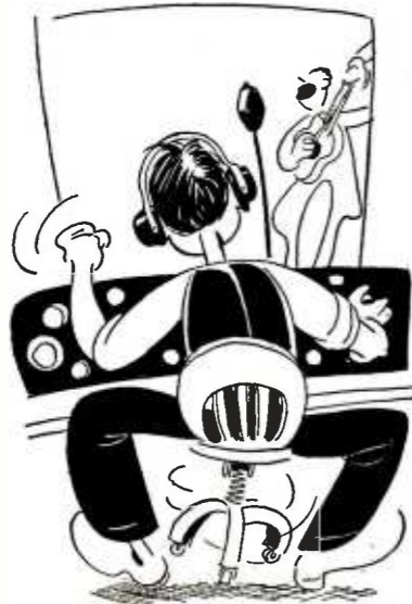
"Put spats on a rustic warbler and bing you've got a crooner."