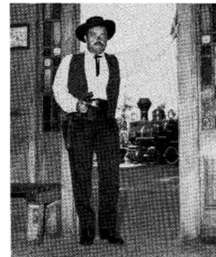
As U. S. Marshal Matt Dillon, William Conrad enacts the exploits of a western law enforcement officer in the 1880's, on "Gunsmoke," every Saturday on WIBW at 11:00 a.m. and 7:00 p.m.

Would you like to make some boy or girl in a Kansas orphan home real happy on Christmas morning? You can, easily. Just save and send Butter-Nut Coffee key strips to WIBW. For several years, the Butter-Nut folks have sponsored their Christmas Club. And we've been proud of our listeners for their thoughtfulness. Please don't send cash, just key strips. Thanks.