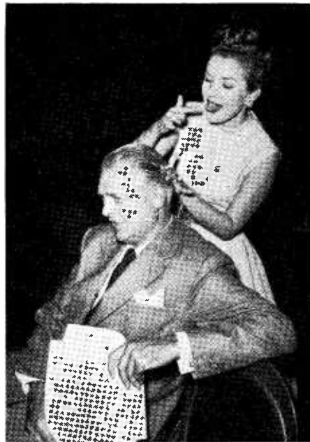
"Little Margie" (Gale Storm) gets her "dad" (Charles Farrell) ready for the show.

It's no wonder Robert Q. Lewis looks like he's having fun when he's acting as master of ceremonies of "The Robert Q. Lewis Show." He really is. Even when he was a boy, he spent his summers organizing and operating kids' theatres in the garage back of the Lewis summer home on Long Island.