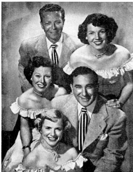
The Rhythmaires on the "Bing Crosby Program" first worked together as a unit in 1945 with Kay Kyser's troupe. They were known as The Campus Kids on Kyser's show.