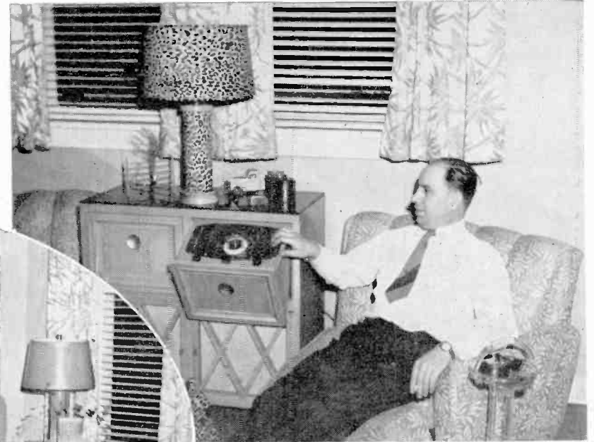
A favorite pastime and a favorite program.