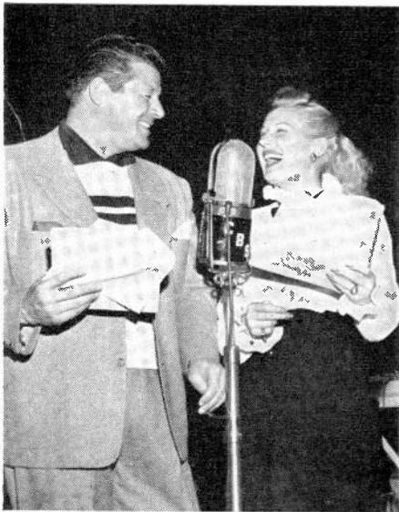
Jack Carson and Marion Hutton

May means vacation time for Rosemary De Camp, who has played the role of Judy Price on "Dr. Christian" since the program's inception twelve years ago. At least she will not be on the program this month while it is in New York. Rosemary must remain in Hollywood to act in "Always Sweethearts," her latest movie.