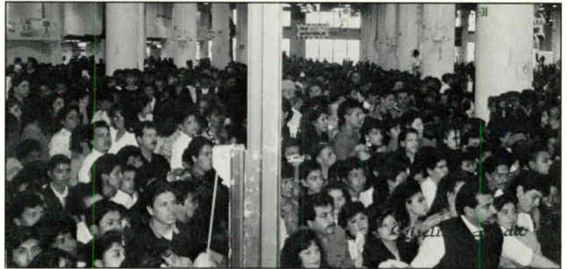
More than 70,000 people attended WIND-AM's 8th Annual Cinco de Mayo Festival.

W IND-AM, Mount Sinai Hospital, and Second Federal Savings Bank held Chicago's first Family Fair in June. Health professionals from Mount Sinai Hospital provided medical consultations and health screenings free of charge and featured live musical entertainment. Children won prizes at WIND-AM's basketball and baseball games booth, and there were special appearances by ex-Chicago White Sox players Chico Carrasquel and Minnie Miñoso. The climax of the event was the drawing for a brand new 1993 Ford Ranger truck, courtesy of Pepsi and Max Madsen Ford.