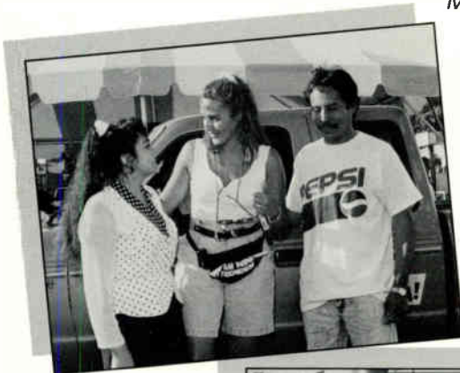
Winner of the 1993 Ford Ranger truck given away at WIND-AM's First Annual Health Fair.