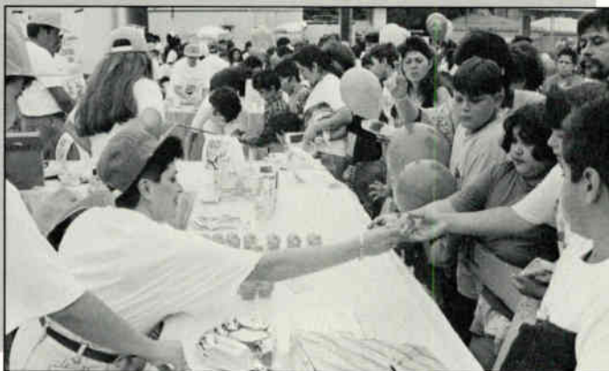
Attendees at WIND-AM's First Annual Health Fair.