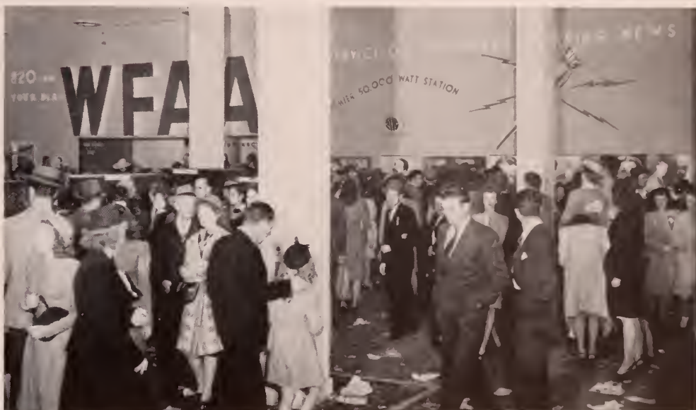
Thousands of visitors to the Texas State Fair passed through the WFAA (Dallas) booth where they were able to hear programs, see stars' photos and caricatures, and receive literature about NBC programs.