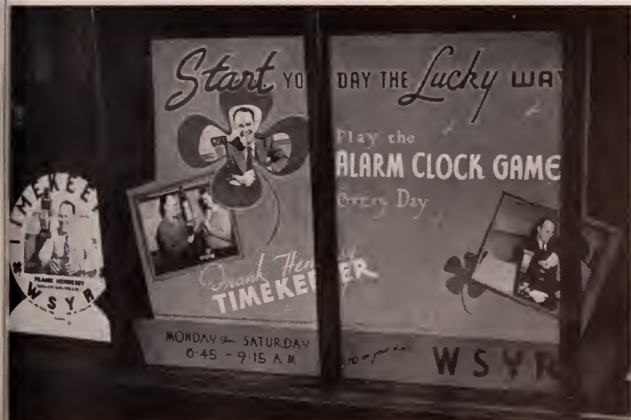
An alarm clock game is getting tremendous attention on the WSYR (Syracuse, N. Y.) "Timekeeper" program, and this window display helped win new listener-participants. Placards, like one at the left, are being distributed.