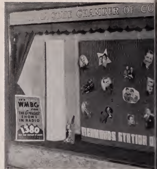
WMBG (Richmond, Va.) obtained the main Virginia State Chamber of Commerce in the Hotel for this photo layout of NBC