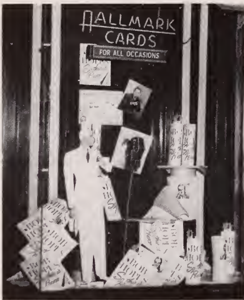
Bob Hope's book formed the background display for this window arranged in Trenton, N. J., by WTTM.