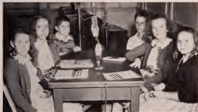
W'SJS sponsored a student panel discussion of the UN. Above are winners of a contest among Winston-Salem schools to select those with best understanding of UN.