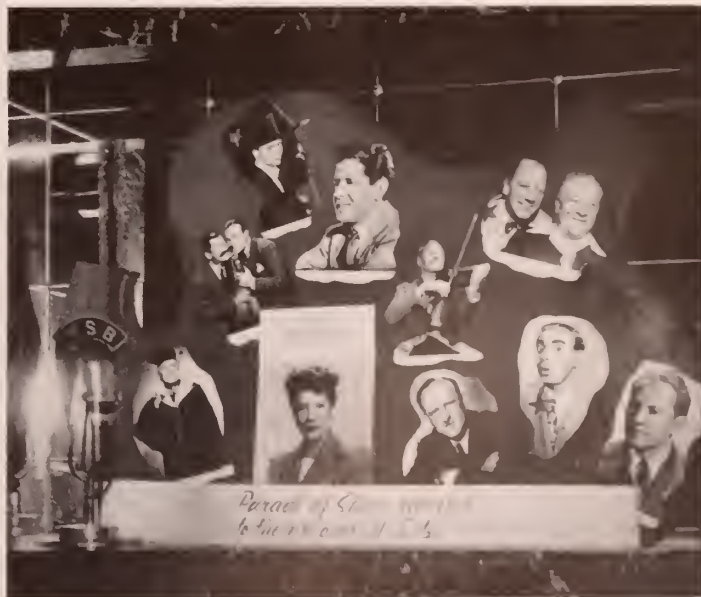
A show window on Atlanta's famed Peachtree Street carries the Parade of Stars message of WSB. Tie-in was made between station and the Davison-Paxton department store.