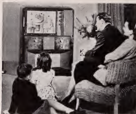
HOME TELEVISION PROGRESS.—A picture almost the size of a newspaper page is produced by this new 1947 RCA Victor television receiver. Table models are at dealers. Console models will soon be available.

The New Jersey Bell Telephone Company featured the news of the changeover in its monthly mailings to 750,000 subscribers. The changeover was extensively promoted by WNBT, NBC's New York television station during telecasts of the crucial Brooklyn-St. Louis pennant