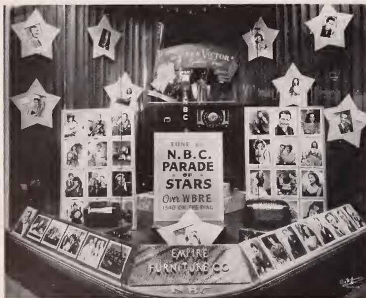
WBRE (Wilkes-Barre, Pa.) set up this photo display of NBC stars as one of the highlights in its NBC Parade of Stars tie-ins. The window proved to be a top-notch attraction.