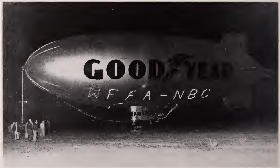
Station and network received attention when Texans obtained "blimp-cast" last-minute news compiled by the WFAA newsroom. The Dallas station flashed the headlines on a neon sign attached to a dirigible.