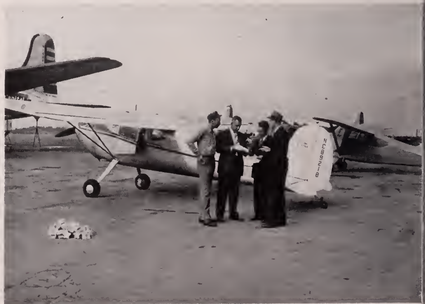
In the Pittsburgh area, a "Shower of Stars" was staged by KDKA when promotion pieces were dropped from planes. A prize for most complete set was offered. Pilots check aerial map before taking off.