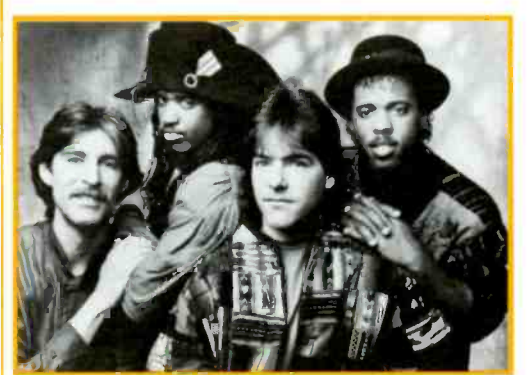
Bela Fleck & the Flecktones