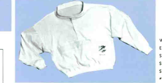
EUROPEAN STYLE SWEAT STYLE