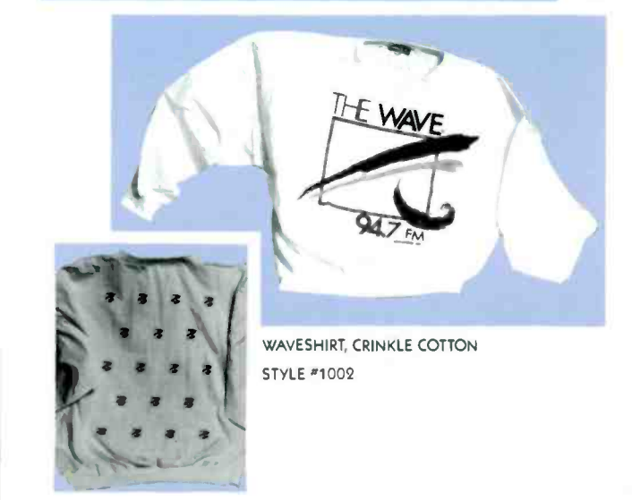
MAIL TO: WAVEWEAR™ KTWV-FM. 94.7 The Wave P.O. Box 4310, Los Angeles, CA 90078