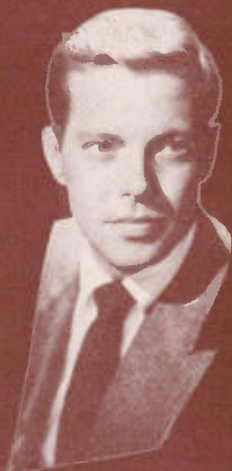
THE DICK HAYMES SHOW