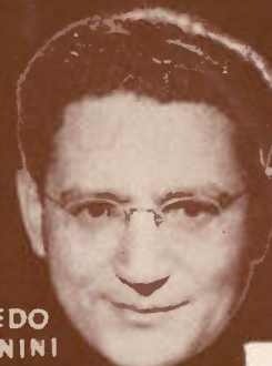
ALFREDO ANTONINI THE STRADIVARI ORCHESTRA