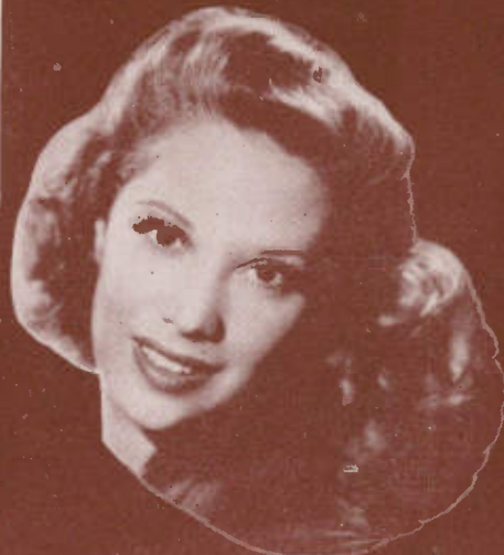
THE DINAH SHORE SHOW