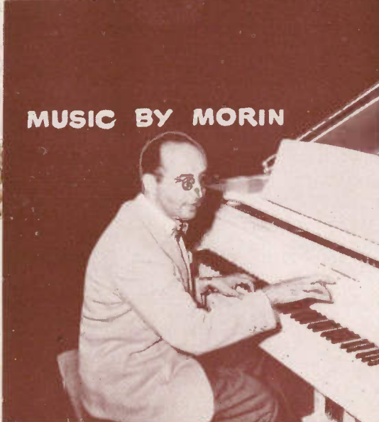
MUSIC BY MORIN