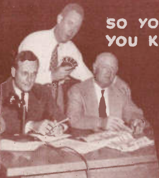
SO YOU THINK YOU KNOW SPORTS