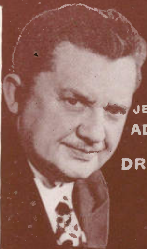
JEAN HERSHOLT ADVENTURES OF DR. CHRISTIAN