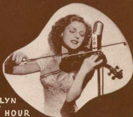
EVELYN THE HOUR OF CHARM