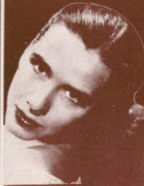
ROMANCE OF EVELYN WINTERS