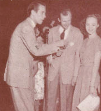
MAN ON THE STREET