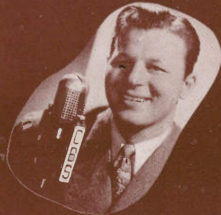
THE JACK CARSON SHOW