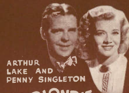
ARTHUR LAKE AND PENNY SINGLETON