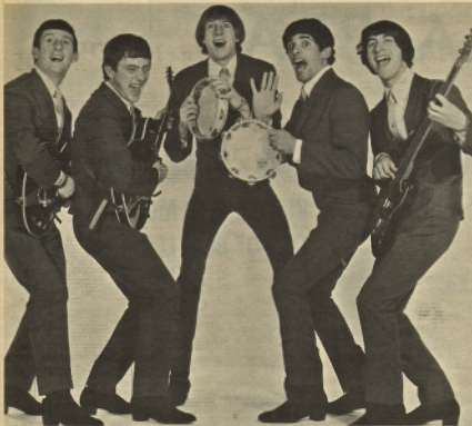
The Beau Brummels — Declan Mulligan, Ron Elliott, John Petersen, Sal Valentino and Ron Meagher.