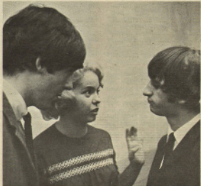
"Please, Ringo, Keep Me In Mind, Anyway"