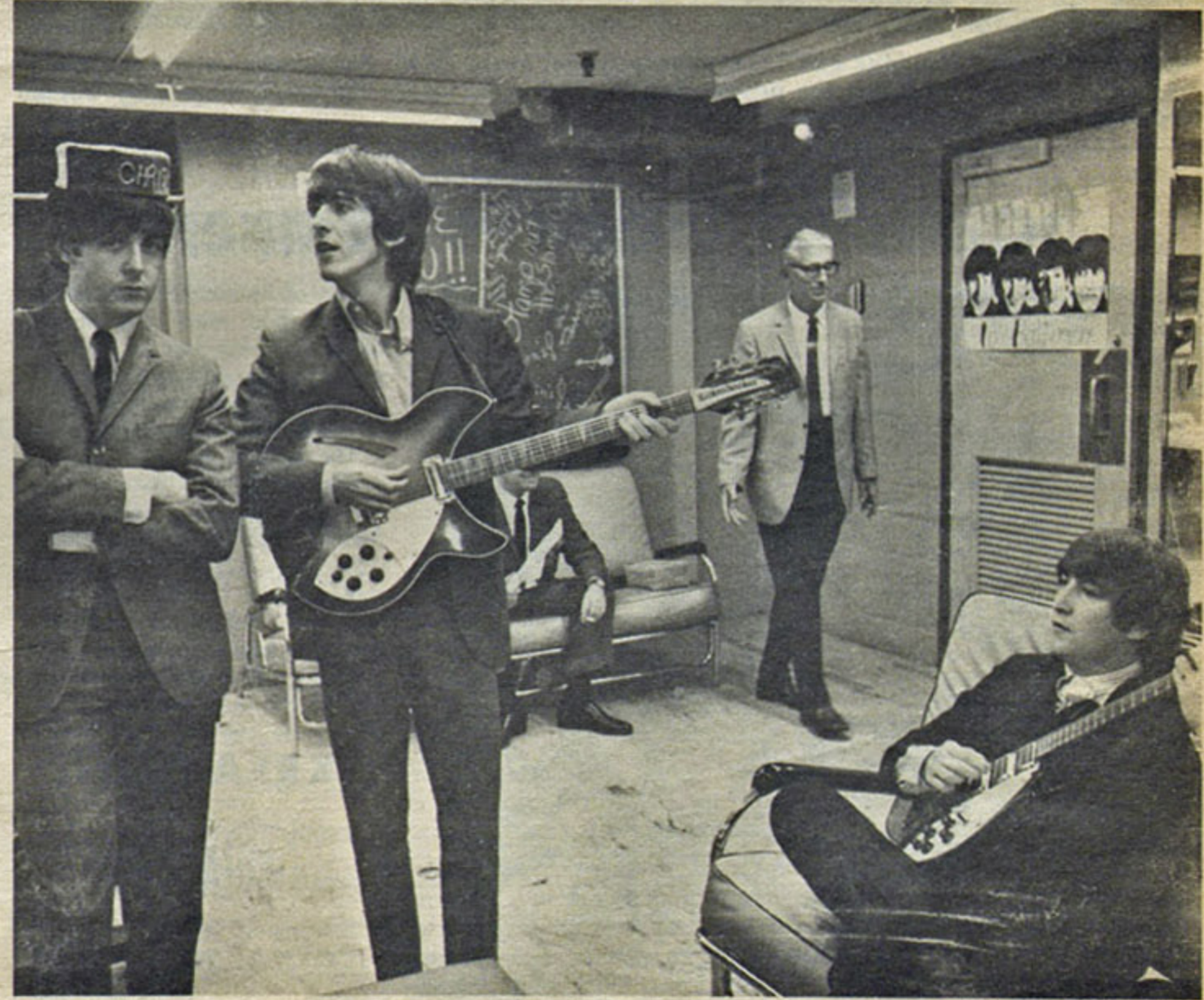
Like a postman who goes for a walk on his day off, THE BEATLES relax for a few moments by strumming their guitars. The kookie hat is a gift from an admirer who finally got to see them for a few seconds.