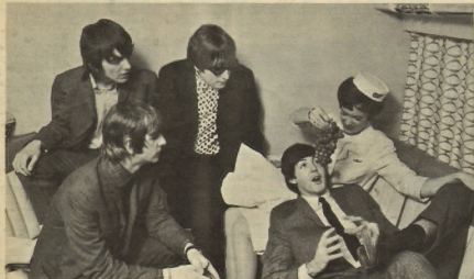
A Hard Day's Night Enroute to Nassau