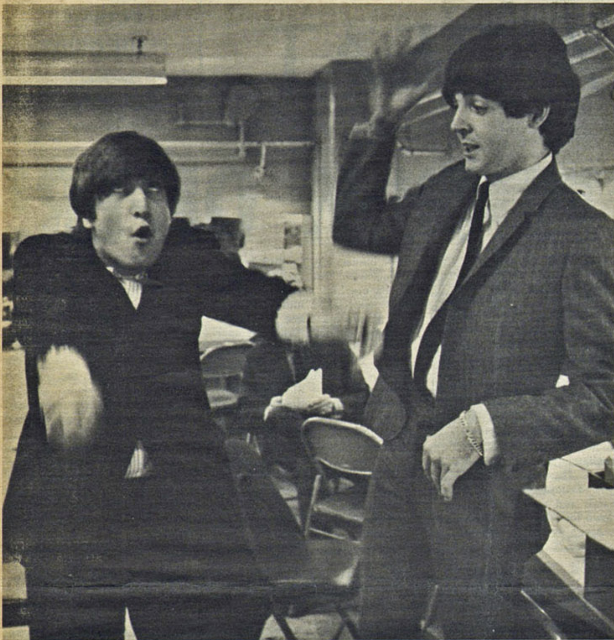
ANOTHER OF THE EXCLUSIVE BEATLES photos to appear in the BEAT. The camera caught the pair in an unguarded moment inside the private dressing rooms set up for the group while they worked long hours on their island adventure story.