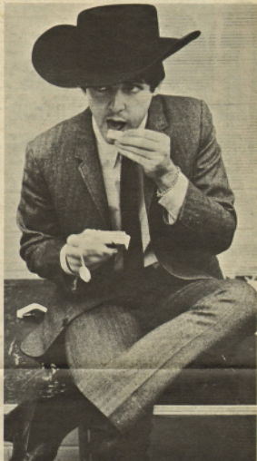
"Looking for Somebody, Stranger?"