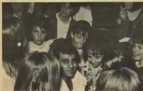
Mobbed by autograph fans after a recent game with the KRLA Aces, one of the players appears to have forgotten something. Fortunately, one of the girls reminded him that he was Casey Kasem.