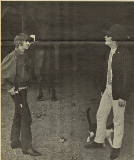
Showdown at the OK Corral