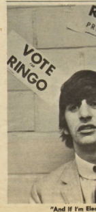
"And If I'm Elected, I Promise . . ."

Send Fan Club information to KRLA Beat, 6290 Sunset Blvd., Suite 504, Hollywood, Calif.