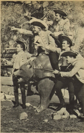
Paul Revere and the Raiders . . . Chargo!