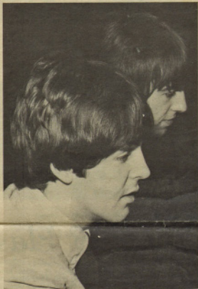
The Bachelors . . . What Are Their Plans?