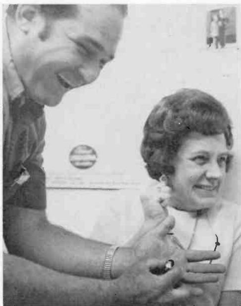
"Quick—get rid of it."