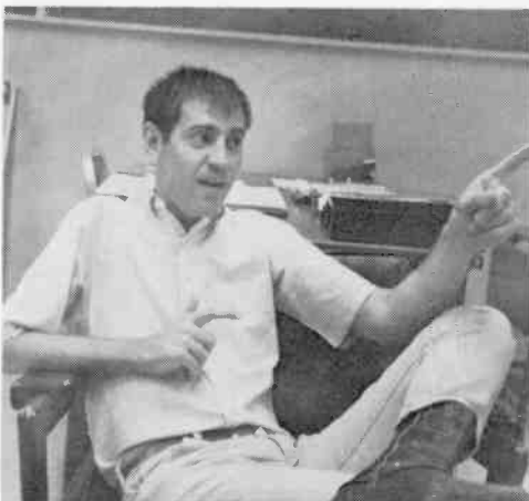
"I like the social life after the game."