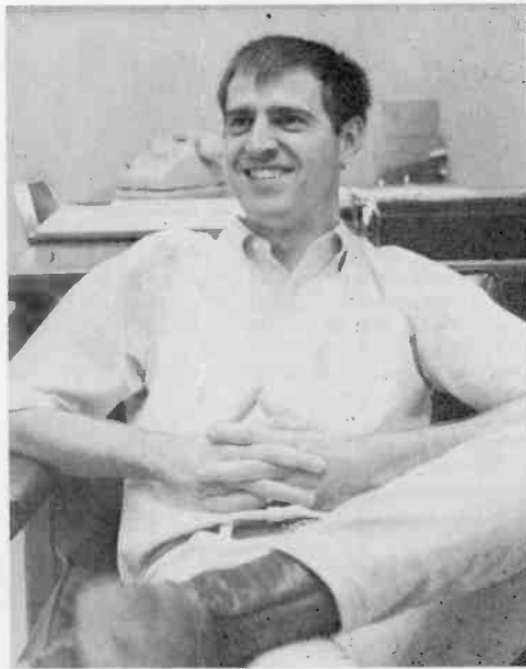
"Do I like Girls Basketball? Of course I do. I also like girls."