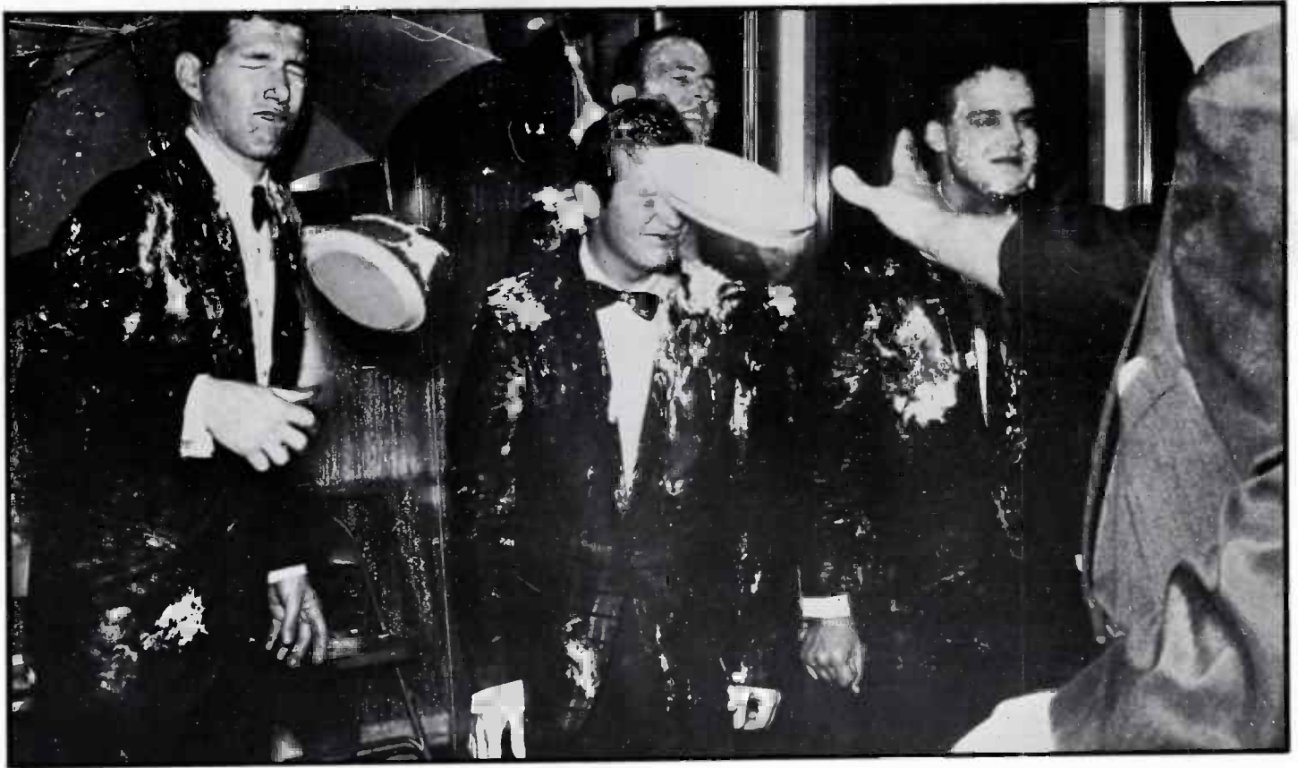
It was a rainy night as WFUN DJ's faced the pies for over an hour. All was not for naught, however; they raised several hundred dollars in contribution for charity.