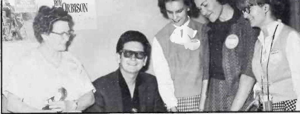
C&W deejays and their wives visiting the MGM Records hospitality suite during the recent Country Music Festival in Nashville were warmly greeted by MGM star Roy Orbison who autographed photos, copies of his new single, "Crawling Back," and his album, "There is Only One Roy Orbison."