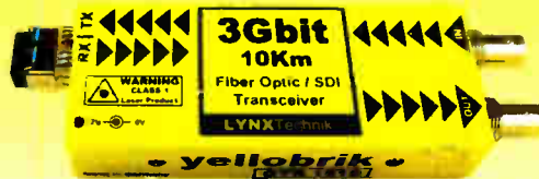
SDI / Fiber Transceiver