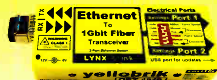
Ethernet to Fiber Transceiver