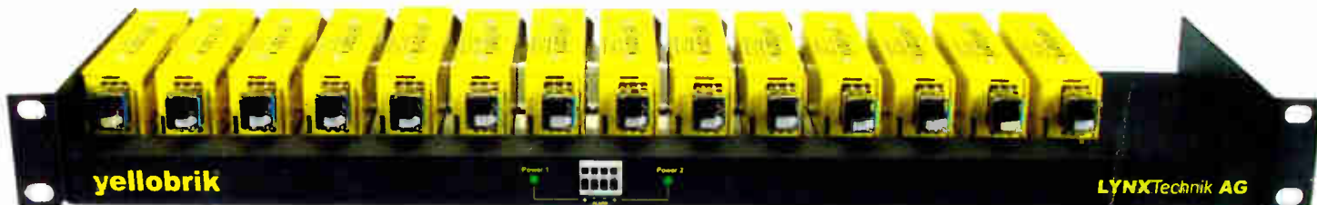
1RU Rack Mount for up to 14 yellobrik 's Central power with redundant protection and GPO output alarms