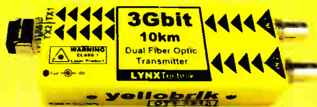
Dual SDI to Fiber Transmitters