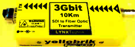
SDI to Fiber Transmitter

All LYNX Technik SDI fiber products are reclocking at 270Mbit, 1.5Gbit and 3Gbit and support all SDI formats, ASI / DVB and SMPTE 310 signals.