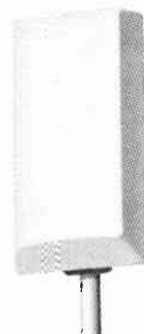
K72314 UHF Panel

For over 50 years delivering the finest in Directional Antennas to UHF Broadcasters