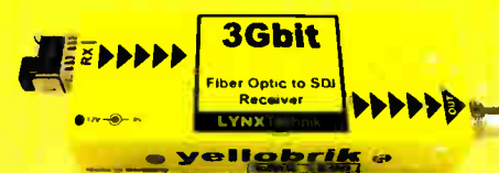
SDI to Fiber Receiver