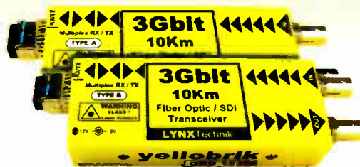
SDI/Fiber Bidirectional Transceivers (send and receive over single fiber connection)