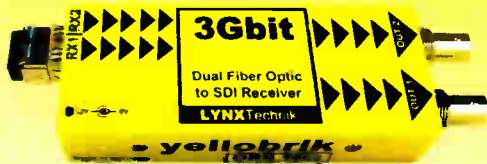
Dual Fiber to SDI Receivers