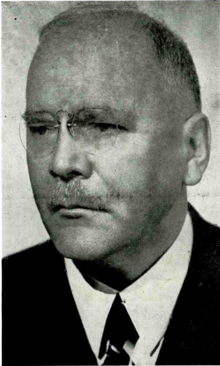
H. V. KALTENBORN, Dean of Commentators

F OLLOWERS of H. V. Kaltenborn should not look forward to the purchase of a definitive collection of his best broadcasts. Such a volume will never be published.