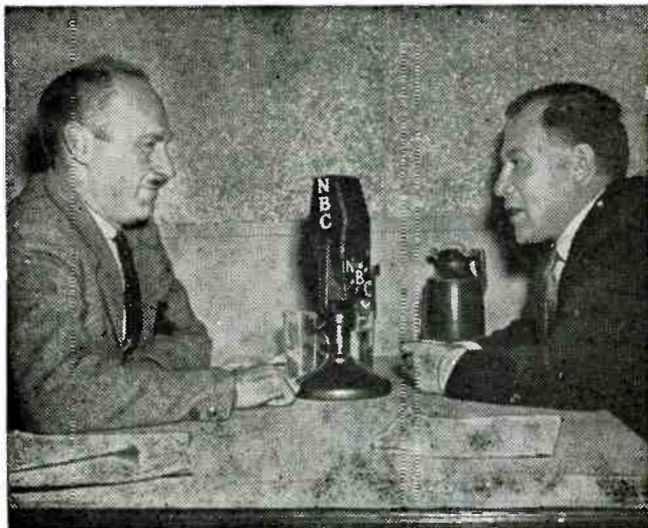
Bearing further proof of the strong bond of friendship which unites the twenty-one American Republics, Washington columnists Drew Pearson (left) and Robert S. Allen have been engaged by the Brazilian government to disseminate "News for the Americas" over the NBC-Blue Network each Sunday, to promote good will.