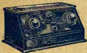
The Crosley 4-tube—4-29