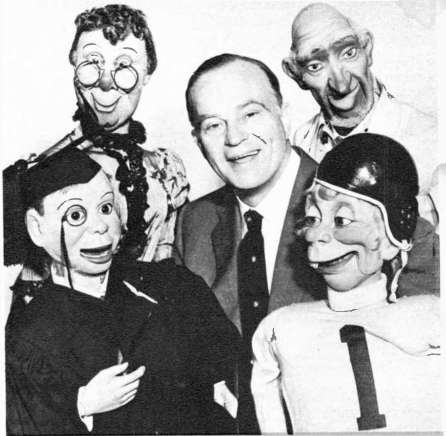
EDGAR BERGEN surrounded by his famous and brainy friends, Charlie McCarthy, Miss Effie Klinker, Lars Lindquist and Mortimer Snerd. Bergen claims it's difficult to outsmart these dummies.

for radio. It's terribly frustrating for him not to be able to kid my chin strap and receding hairline on television. TV kills some of his best gags and this makes him most unhappy. Then, too, he claims that I, his close associate for 10 to these many years, become difficult to work with when we're on camera. Frankly, I think it's just his deflated ego that bothers him. He's not as photogenic as he'd like to be, you know.