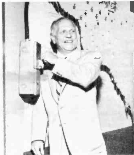
GOVERNOR GOODWIN KNIGHT pulled the switch to activate KCOP'S new transmitter atop Mt. Wilson. Channel 13 is now the most powerful TV station in Los Angeles.