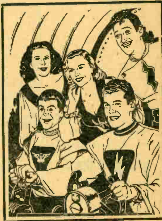
"TONGA" "CAROL" "ROBBIE" "HAPPY" "BUZZ"