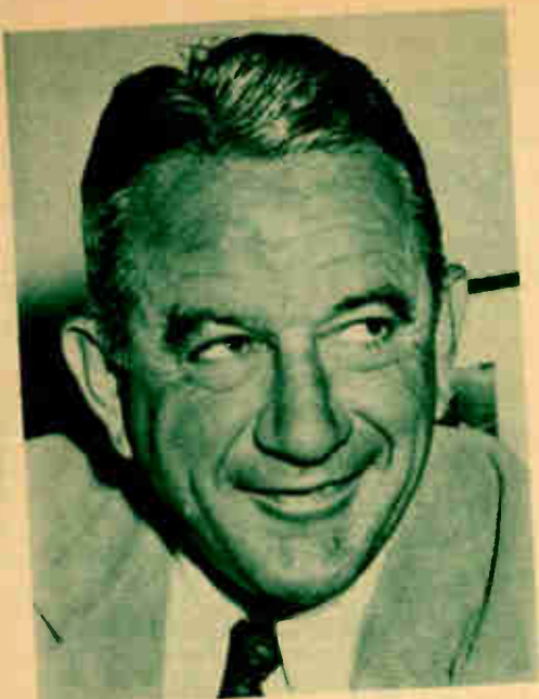
RECOGNIZED AS one of the finest grid coaches in the country, Red Sanders of UCLA has been priming his squad all season long for the titanic struggle this week against their arch rivals, USC.