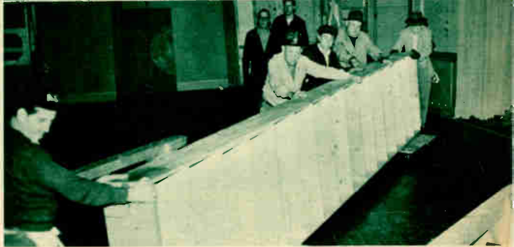
▲ ANOTHER PIECE OF THE RING base is hoisted into place. Amateur Athletic Union regulations are carefully conformed to from the building of the arena to the choice of fighters.