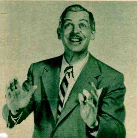
1966—Here's one they'll never steal from Berle.