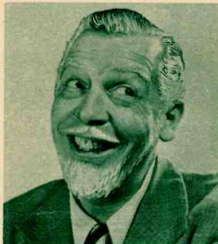
1971—I'll Kiwwwl you!