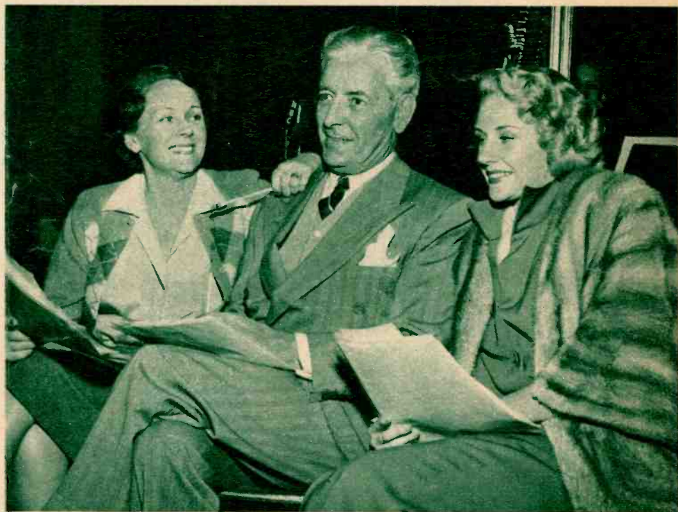
▲ PEABODY AWARD-WINNING SHOW, "HALLS OF IVY," requires a lot of rehearsals from its principals, Benita and Ronald Colman, who are shown with a recent guest vocalist on the program, lovely songstress Lucille Norman.