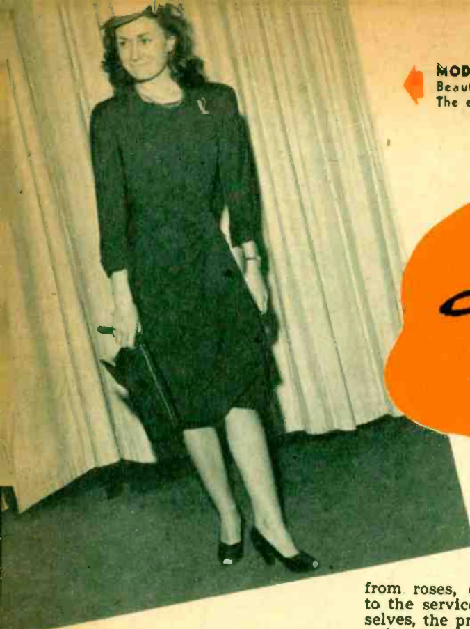
MODEL MARGARET RUTHERFORD shows up at "Lady Be Beautiful" and demonstrates what can happen on the program. The experts decide to take her on.