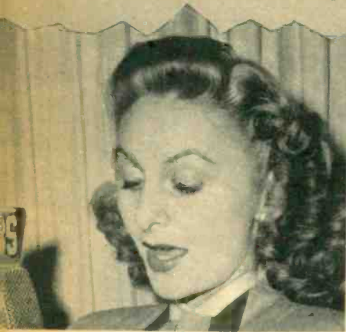
▲ MARY JANE CROFT is radio comedienne you'll be hearing much of on CBS' Durante-Moore show, featuring her novelty "dict-yon".