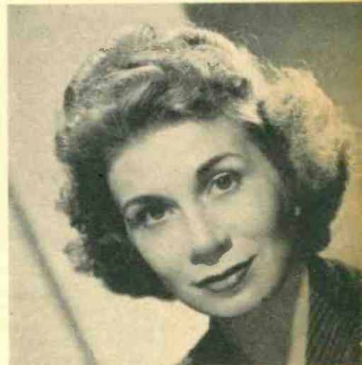
▲ BEA BENEDARET , recognized for her fine work as Eve Goodwin on "Gildersleeve", makes almost regular appearances on "Lux".