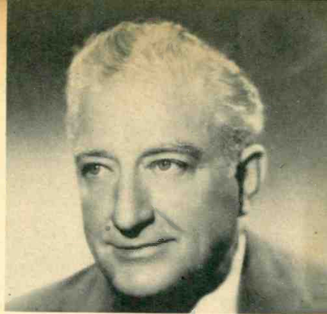
▲ FRANCIS X. BUSHMAN , screen idol of the twenties, plays ministers, judges, tycoons, and clubmen on "Lux".