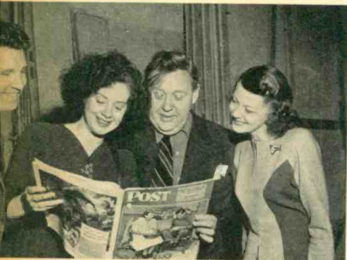
▲ RECENT "REQUEST PERFORMANCE" was four-star event with Ozzie Nelson, Elsa Lanchester (Mrs. Laughton) Charles Laughton, and Harriet Hilliard.