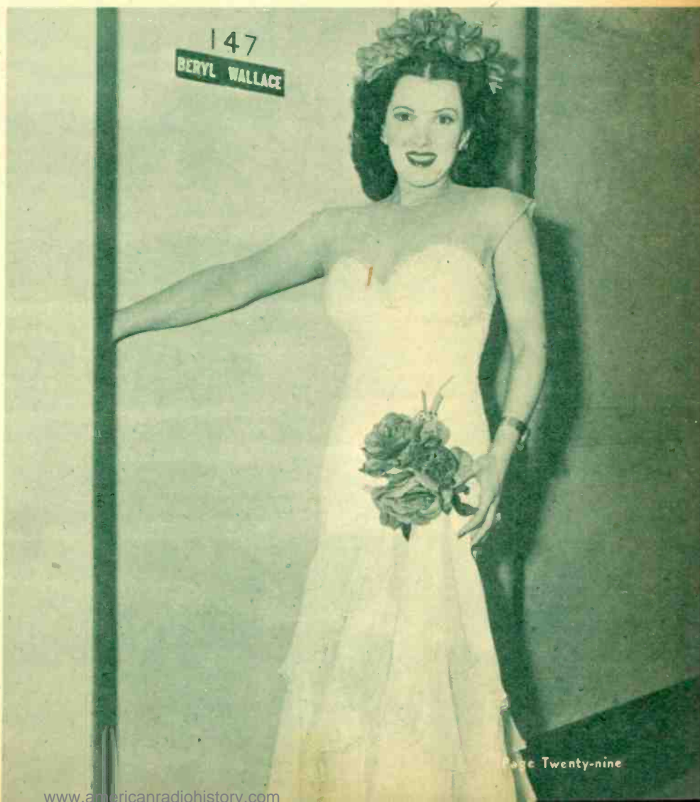
"FURLOUGH FUN" FEMCEE in the gorgeous white lace Spanish dress her Gilmore sponsor gave her to wear on the Friday night broadcast.

"I was so excited about being called a 'dramatic actress' that I hung up and had to call back and find out what show it was they wanted me for."