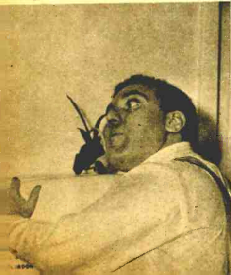
8. BUT LIKE EVERY AMERICAN FAMILY , the Rileys are sinking their extra money into war bonds. And there you have background of radio's "Life of Riley."