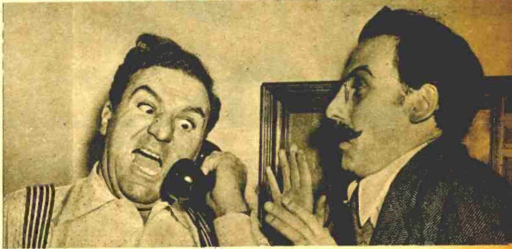
5. RILEY TRIES TO CALL OFF one of Baxter's schemes before it costs him dough. (It always does) Riley's war-plant salary barely makes ends meet. (Did we say meat?)