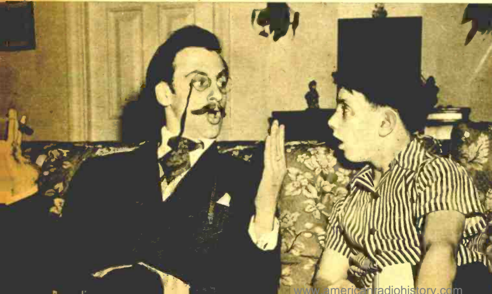
6. UNCLE BAXTER'S SMOOTH TALK and business deals keep Riley in constant hot water, but Junior is a sucker for Uncle's tall tales.

Sunday, 12 p. m. Blue-KECA R ADIO'S newest family series, "The Life of Riley," looks for the humor in everyday living, made complicated by a world at war. The Rileys can't rent a house, they have trouble getting a phone, they become involved in shortages and they have trouble with the restless younger generation (even as you and I)!