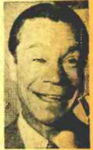
Joe E. Brown