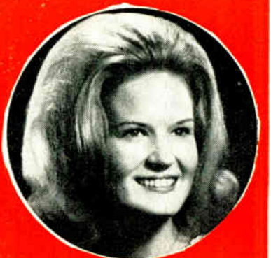
Lynn Anderson Chart # 59-1059