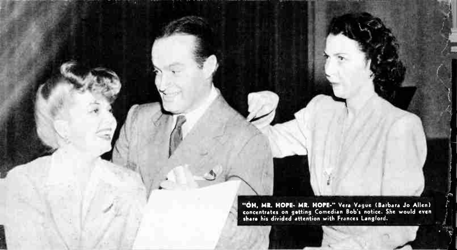
"OH, MR. HOPE- MR. HOPE." Vera Vague (Barbara Jo Allen) concentrates on getting Comedian Bob's notice. She would even share his divided attention with Frances Langford.