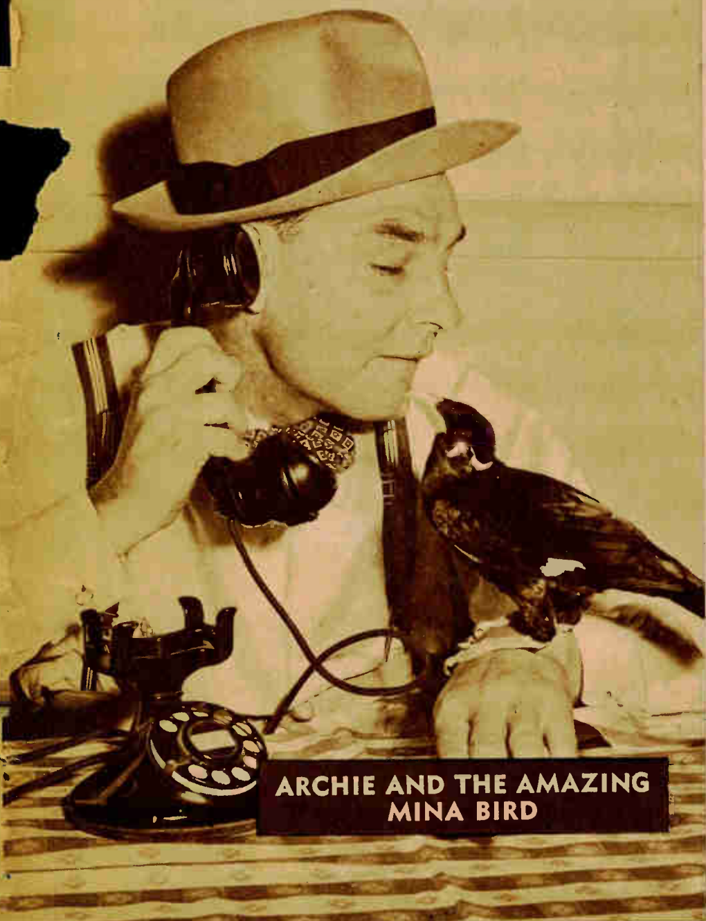
ARCHIE AND THE AMAZING MINA BIRD