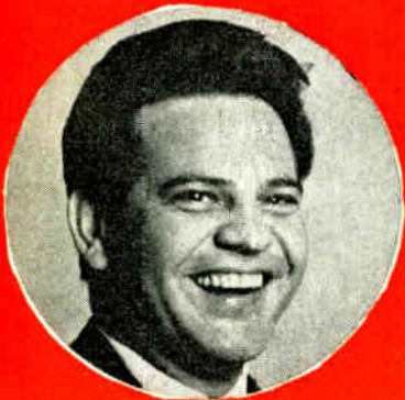
Johnny Dollar Chart # 59-1057