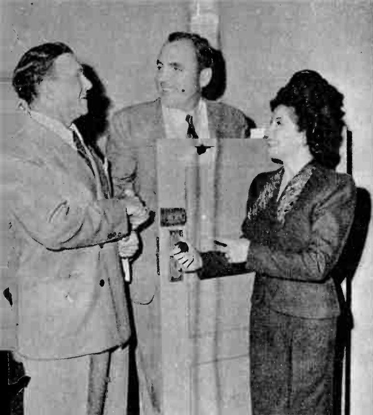
▲ HERE'S THAT DOOR! You hear it open every Tuesday at 6 over CBS-Knx, when Gracie Allen opens it and calls out, "Oh, George! We've got company!" Caller at this time was Pat O'Brien.