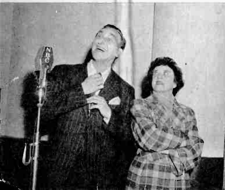
▼ NEWCOMERS TO HOLLYWOOD NBC MIKE are John Brown and Minerva Pious, who attained marked popularity on the Fred Allen show. Now they are with Jack Benny.