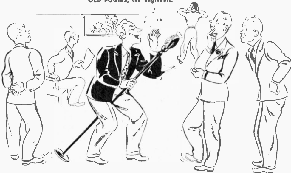
MIKE HOG MICKEY (Picture sell explanatory—same as road hog).