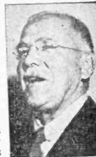
H. V. KALTENBORN

Of course, if you are a confirmed Kaltenborn fan, and a passing street car made you miss a word of the 4:45 program, you can listen to both shows. There will be no objections from KFI, NBC or Mr. Kaltenborn's sponsors.