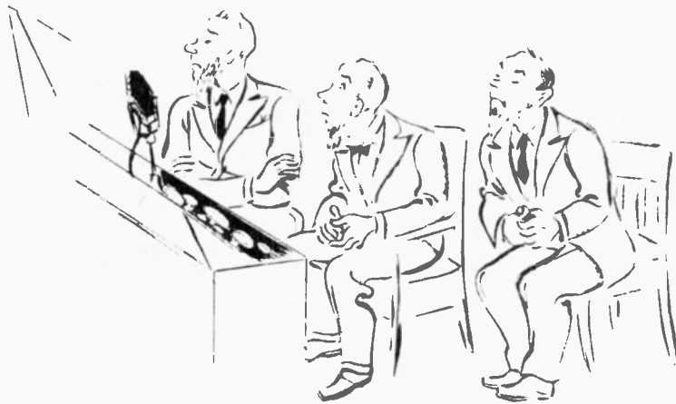
OLD FOGIES, the engineers.