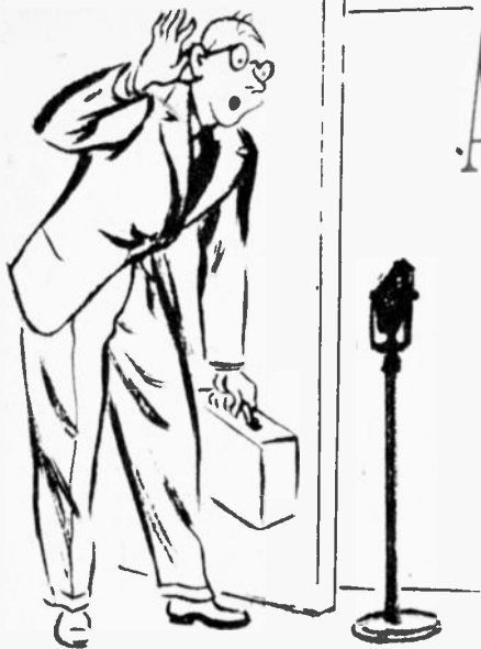
ACOUSTIC ALGERNON , would change the vibrations, if he could.