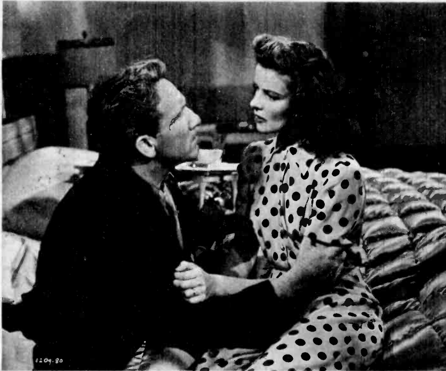
▲ LEADS IN "SCREEN GUILD'S" show, KNX, April 19, 7 p. m., are Katharine Hepburn and Spencer Tracy, portraying same roles for radio they did on screen. Vehicle: "Woman of the Year."