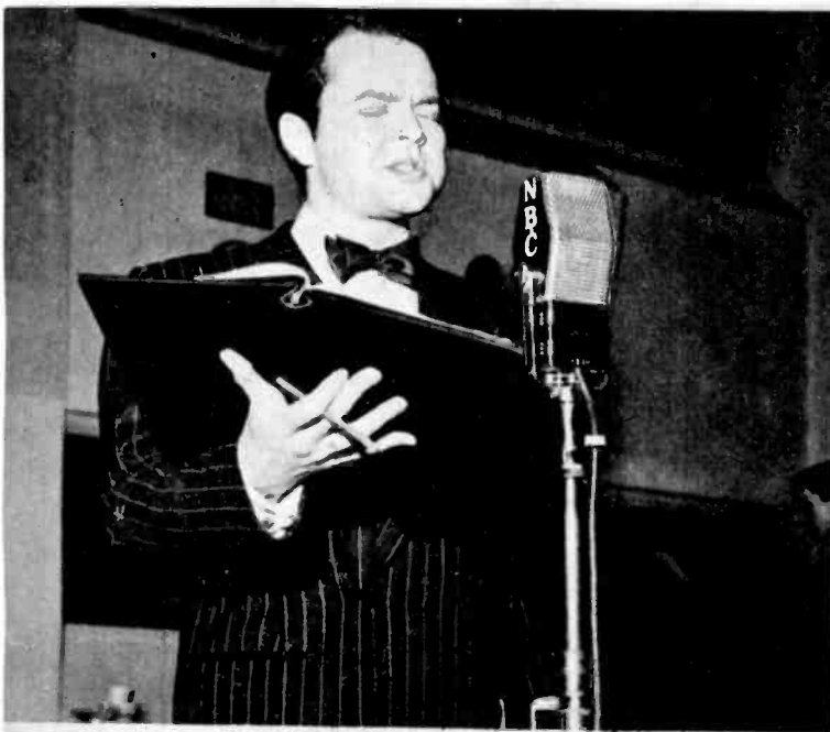
HERE'S THAT MAN as he puts "his all" into his lines. When he was asked how he liked to do comedy, he replied, "Like? I've done comedy all my life!"