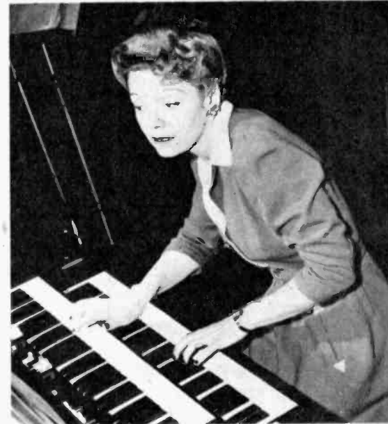
↑ AND NOW into a difficult passage.

↓ WORKING TOGETHER are orchestra leader Mark Warnow and organist Ethel Smith. Ethel just recently joined "Hit Parade," but her popularity with listeners has zoomed. She has introduced an entirely new school of organ playing.