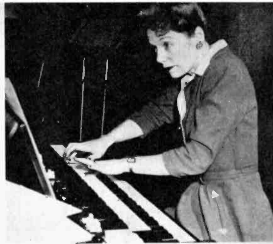
↑ HERE WE GO up the scale.

You keep right on telling me what they are, and I'll play 'em.