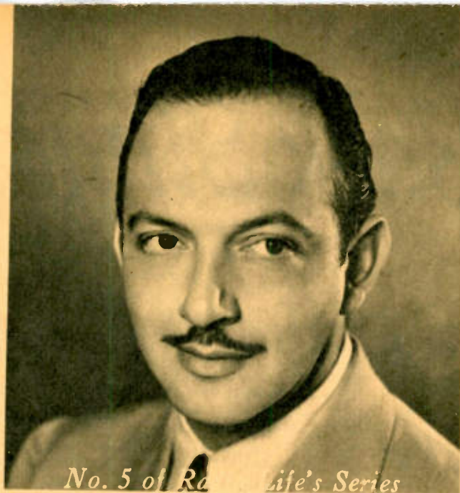
No. 5 of Radio Life's Series On Supporting Players

And it took that and seventeen years to convince my brother!