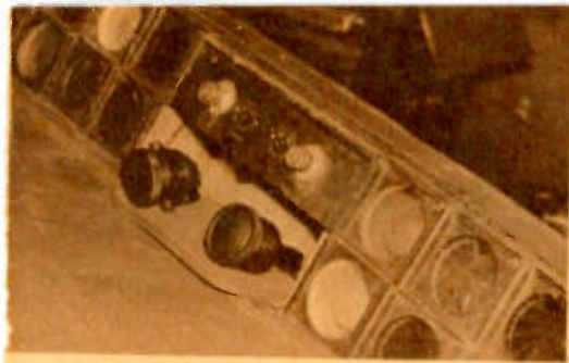
HIDDEN AMONG THE FOOTLIGHTS are microphones that pick up the voices from the stage.