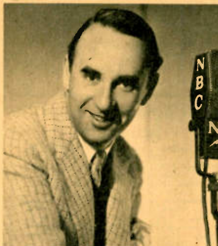
WISE CRACKER DE LUXE and competent emcee of "Battle of the Sexes" is Walter O'Keefe. He made his first splash in radio pinch-hitting for Fred Allen.