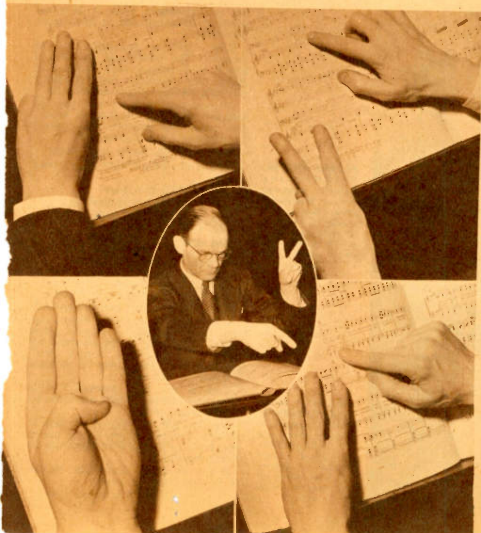
OPERA'S WELL IN HAND as the production manager gives the cues to the engineer. Starting top left and going clockwise, the signals say: trio, soft; duet, very soft; quartette, soft; male voice.

Not only are the operas heard in this country, but also in South America. Another sound proof booth in the rear of the Met houses another announcer and engineer who handle the broadcast for approximately 4,000,000 of our southern friends.