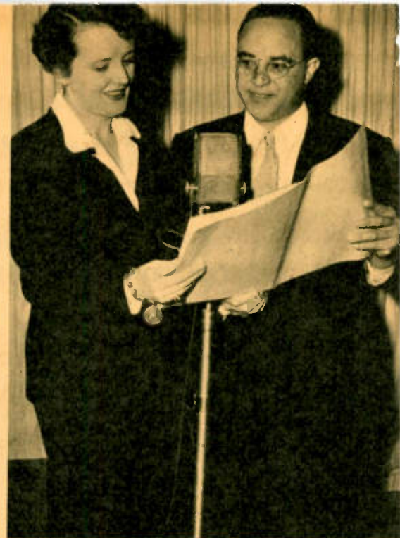
PROFESSIONALS WHO WANT CHANCE besiege Mary Astor for placement on her "Hollywood Showcase." In past 18 months, 400 have displayed their talents.