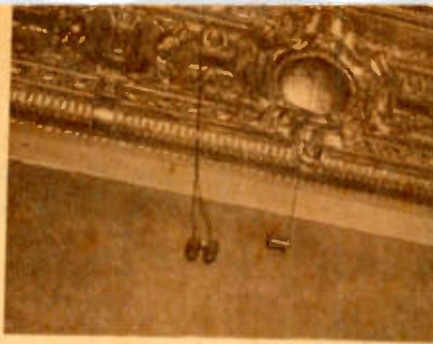
HANGING IN MID-AIR 35 feet above the orchestra are the microphones that pick up the music.

the job to bring to arm-chair listeners the beautiful arias.