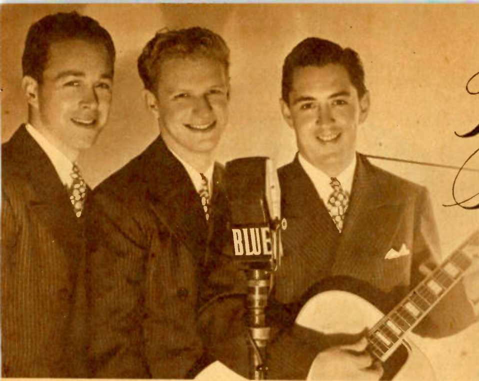
THREE ROMEOS , trio on the "Breakfast Club," got their start in radio when they took a dare to make an audition in a furniture store display window.