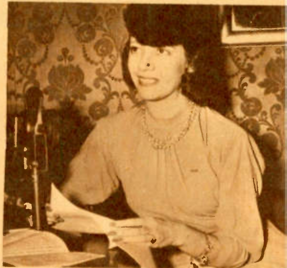
LILY PONS, popular coloratura soprano, stands ready to go on the air as a special commentator.