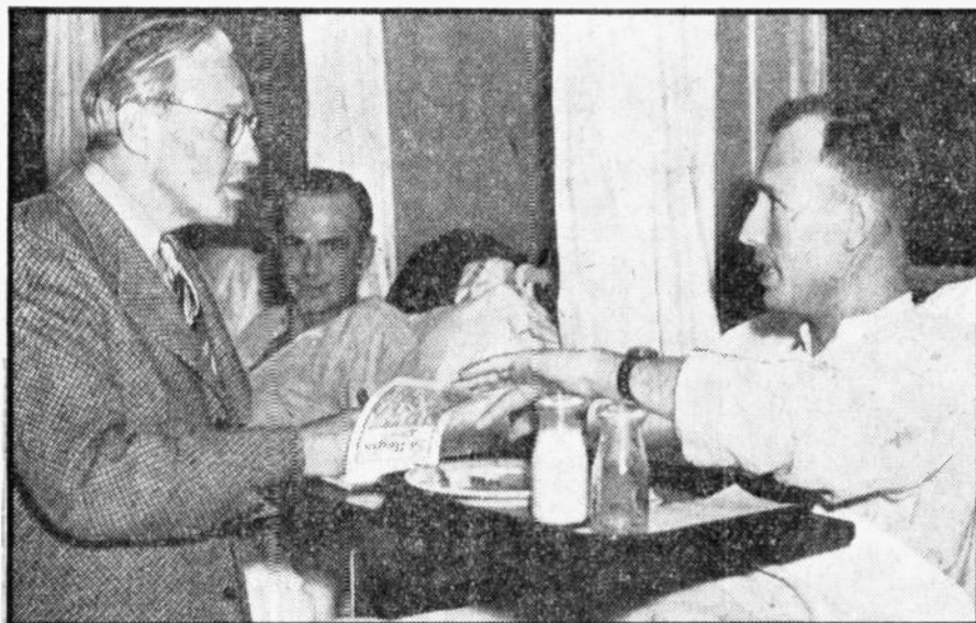
NEVER TOO BUSY . . . Jack and his gang of funsters brought added smiles and cheer to March Field boys confined to the air base hospital. Jack signs his autograph for one of the boys who apparently can't quite make up his mind what he wants the NBC star to write.

With the intrepid, record-breaking laugh pilot, Jack Benny, at the wheel, the Benny Maxwell roared into the big U. S. Army Air Corps base at March Field (Riverside, Calif.) a fortnight ago to salute Uncle Sam's officers and men with a Sabbath salvo of mirth and music.