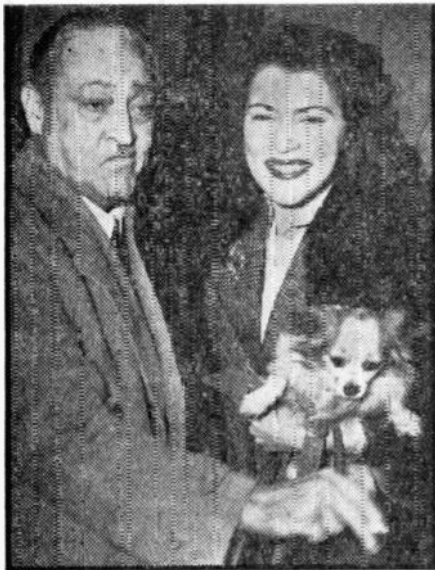
Great Lover Barrymore, who has wooed many, plays Romeo to his Daughter Diane's Juliet this week. See Pre-Cast Page 15.