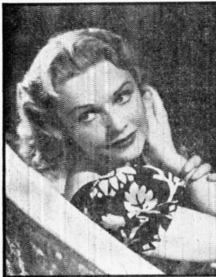
Madeleine Carroll, the delectable, makes a guest visit on Cavalcade of America, Monday, Jan. 26. See Pre-Cast this page.