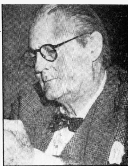
Lionel Barrymore substitutes for brother, John who is taking sick leave from Rudy Vallee's show. Joan Davis is guest, too. See Pre-Cast this page.