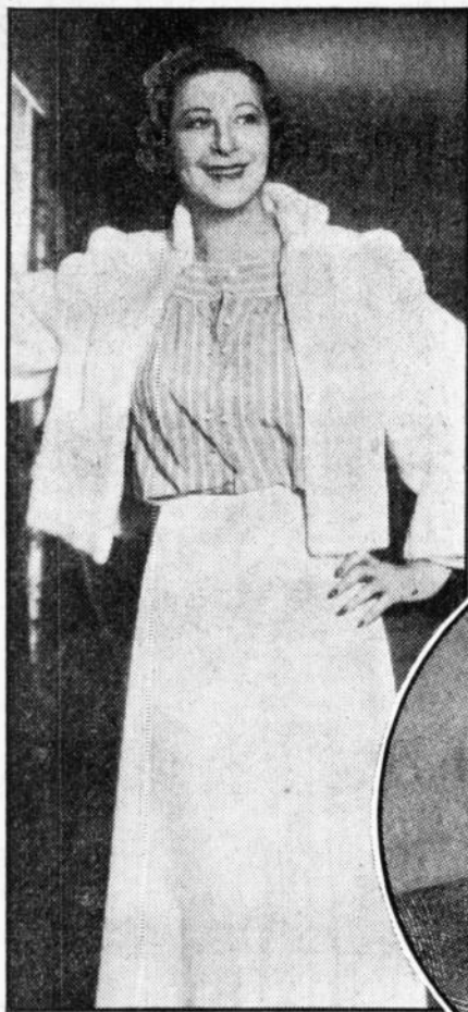
Two champions to whom perfection is a never-ending dream, and to whom the business of being funny is no business at all.