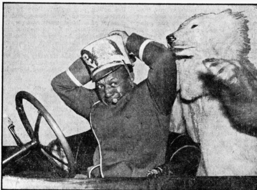
Benny's Maxwell, Benny's Rochester, Rochester's Carmichael. (See Santa Comes to Town)