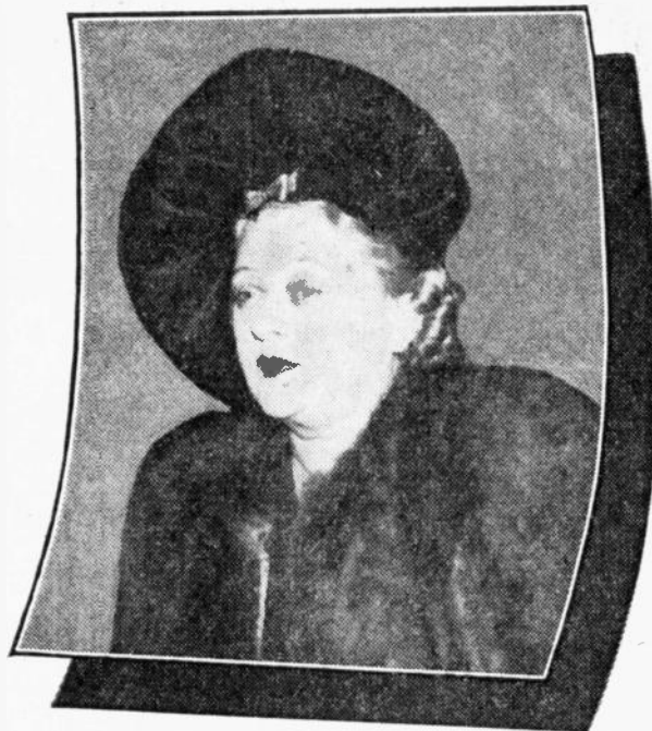
There's a reason . . . why she's braver than ever any radio character she writes can possibly be.