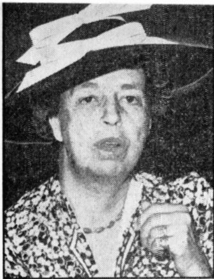
Continuing her stunts on current events. Mrs. Franklin D. Roosevelt speaks Sundays on her "Over Our Coffee Cups" series. See Pre-Cast page 7.