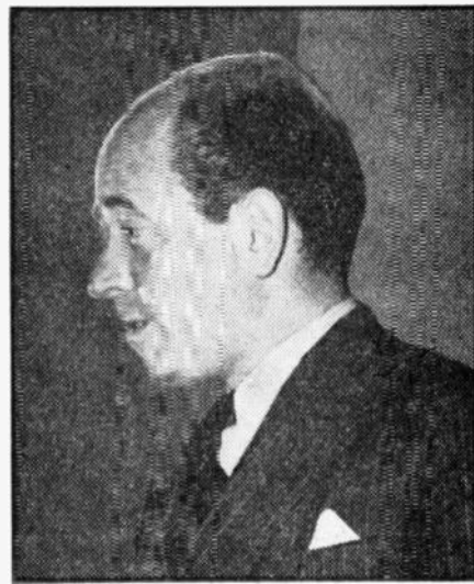
Eugene Ormandy, noted conductor, wields baton Sunday on the Ford Hour Guest pianist appearing with him is Eugene List. See Pre-Cast page 7.