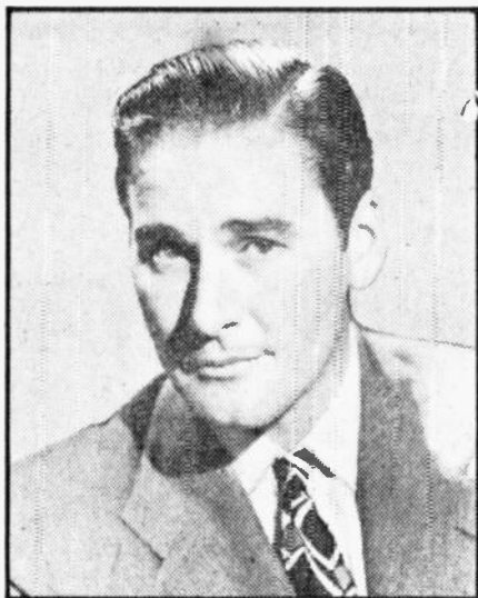
Errol Flynn is slated to write a swashbuckling chapter in Silver Theater annals in "For Richer—For Richer." See Pre-Cast page 7.