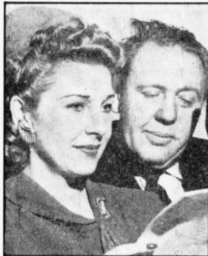
Three Ring Time, which airs over the Blue Network this week, stars Charles Laughton and Shirley Ross (pictured) and Milton Berle. See Pre-Cast this page.