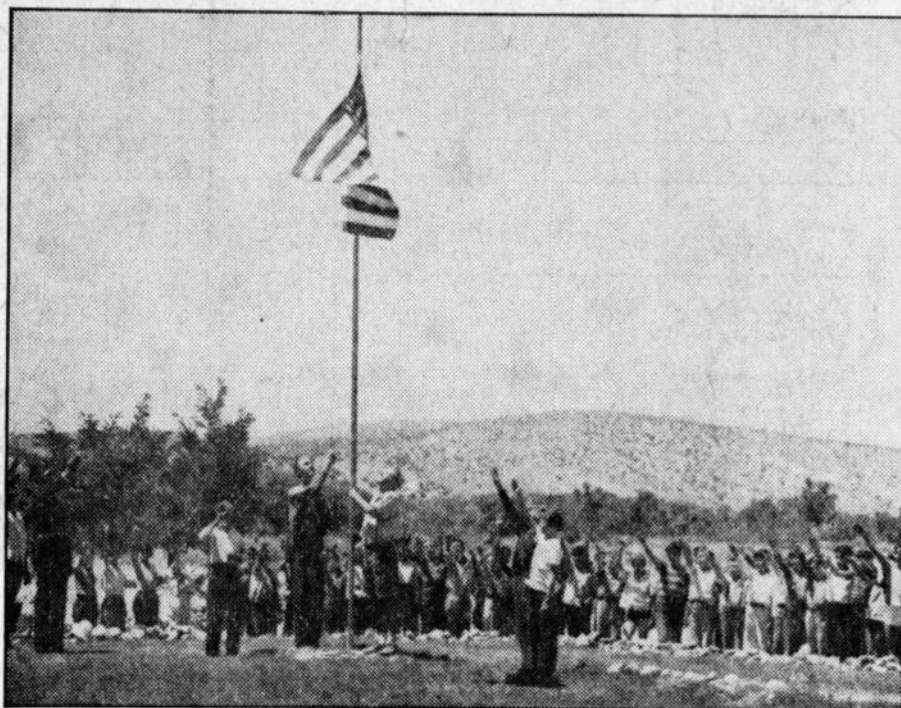
FLAG RAISING CEREMONY at Camp Valermo, where over 1000 underprivileged children are given a week's holiday each summer as guests of the Los Angeles Police Department.