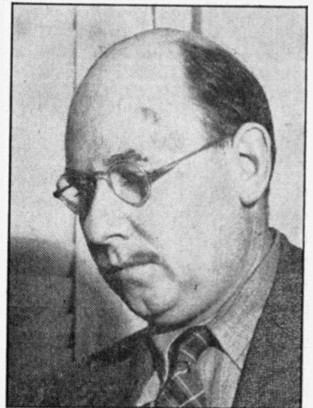
Carlton E. Morse

"Although 'I Love a Mystery' was introduced on the air after 'One Man's Family' had been broadcast for several