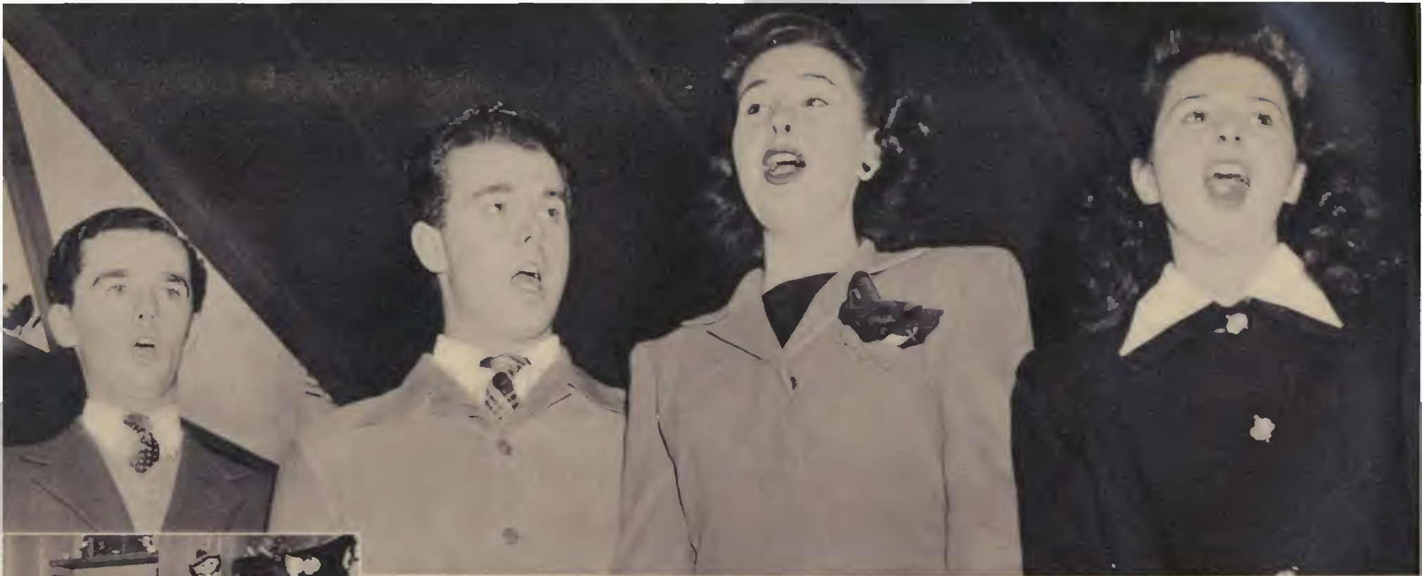
NO longer a roly-poly little girl but a streamlined youngster who's as modern as tomorrow in her ability to accomplish a great deal in a wholly efficient manner, Jane Withers has discovered a multitude of things that every kid of her age can do in the nation's all-out war effort. Selling War Bonds and Stamps is one. Above: Freddie Bartholomew, Jackie Moran, Jane and Virginia Weidler sing "America" at Victory House, sales headquarters for War Bonds and Stamps in Los Angeles