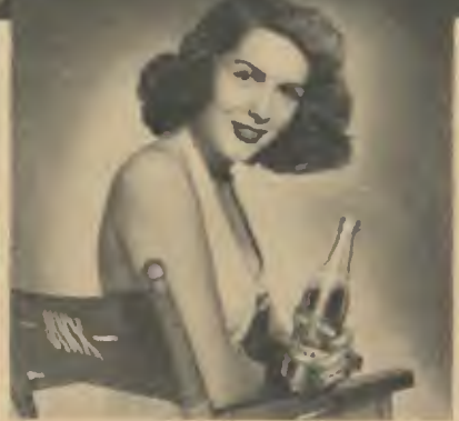
Her choice for best-tasting turned out to be Royal Crown Cola. "It was so much better than now, when I feel like a 'quick-up,'" says Miss Falkenburg, "I always insist on a frosty bottle of Royal Crown Cola." Try a one that tasted best to her.