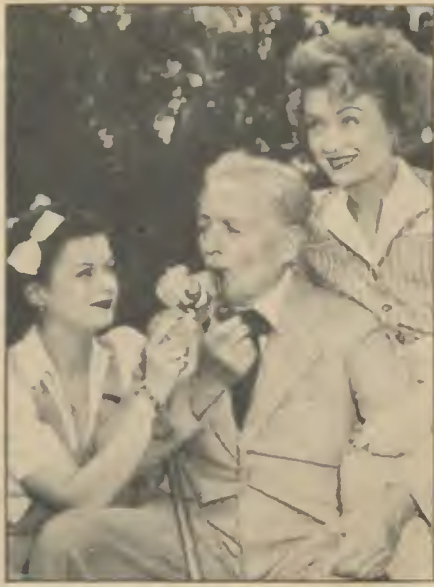
JOAN and Constance Bennett celebrate double anniversary with their dad Richard—his 72nd birthday, 50th mile-stone as an actor

"Jingle Jangle Jingle," a catchy song which Frank Loesser and Joe Lilley wrote for Paramount's "Forest Rangers." You'll soon be hearing Fred McMurray and Paulette Goddard singing it in that picture. Evidence that it is slated for the hit bracket is the fact the Merry Macs, Freddy Martin, Guy Lombardo and Kay Kyser have all made recordings of the tune. Veteran lyricist Loesser contends that Lilley is potentially the greatest music-writer in Hollywood. You'd believe him, too, if you heard Joe for hours on end entertaining at the piano, manufacturing impromptu ditties and compositions you'd swear would be hits once they reached the music stands . . .