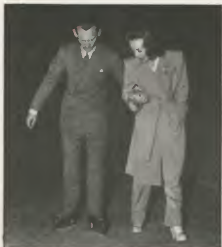
SAMMY KAYE gets first skating-lesson from expert Sonja Henie

K ING of Sway and Swing, and conceded authority on the sort of music women like, Sammy Kaye, whose orchestra is making its feature-picture debut with Sonja Henie in the 20th Century-Fox film "Iceland," had a tough time trying to skate, finally gave it up as a bad job. Fact of the matter was, Sammy continued to fall—notwithstanding! Even the incomparable Henie, who offered to teach him the art, despaired. After that Jack Oakie and Osa Massen, also featured in the movie, attempted to give Sammy a whirl around the "Iceland" carnival rink set. But they failed, too. Said Sammy dolefully, "I'm giving up skating. From now on, I'll take my downbeats in swing and leave the skating in 'Iceland' to Sonja Henie."