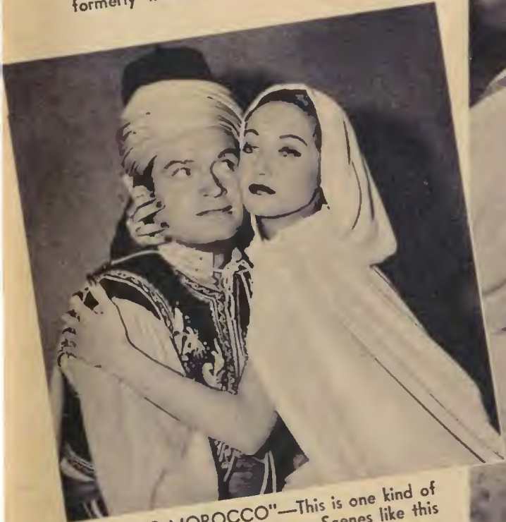
"ROAD TO MOROCCO"—This is one kind of activity that keeps Hope busy. Scenes like this one with Dorothy Lamour in the forthcoming Hope-Crosby-Lamour film may look like pleasure, but picture-making is still exacting work