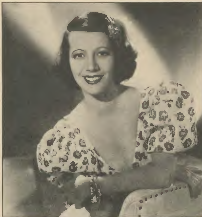
HAILED as one of the most glamorous and popular opera stars of all time, coloratura Lily Pons makes one of her infrequent radio appearances Monday night as guest of the "Telephone Hour," NBC

I was not meant for. So I went to New York, some eight or nine years later. There I began to study music again, taking up fugue and counterpoint, and so on. I got good, tough training in those subjects and I had to work like anything.