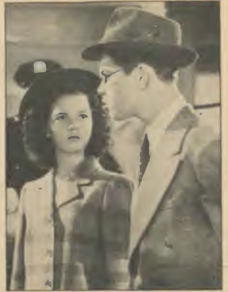
SHIRLEY TEMPLE and Dickie Moore in a scene from Shirley's latest, "Miss Annie Rooney," in which she has her first romance

COUNTRY FAIR (VVVV): You visit a fair full of talking animals, honest!—Family.