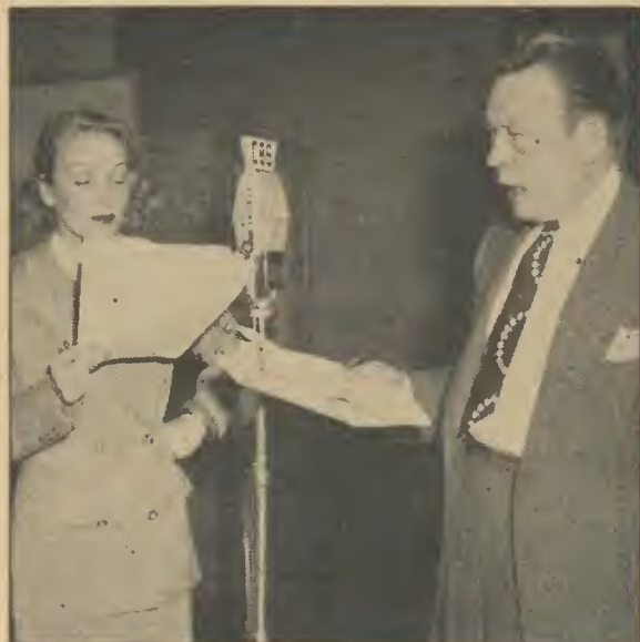
GLAMOROUS Marlene Dietrich rehearses with Fred Allen just before "Star Theater" hits the air. Show is a Sunday CBS feature