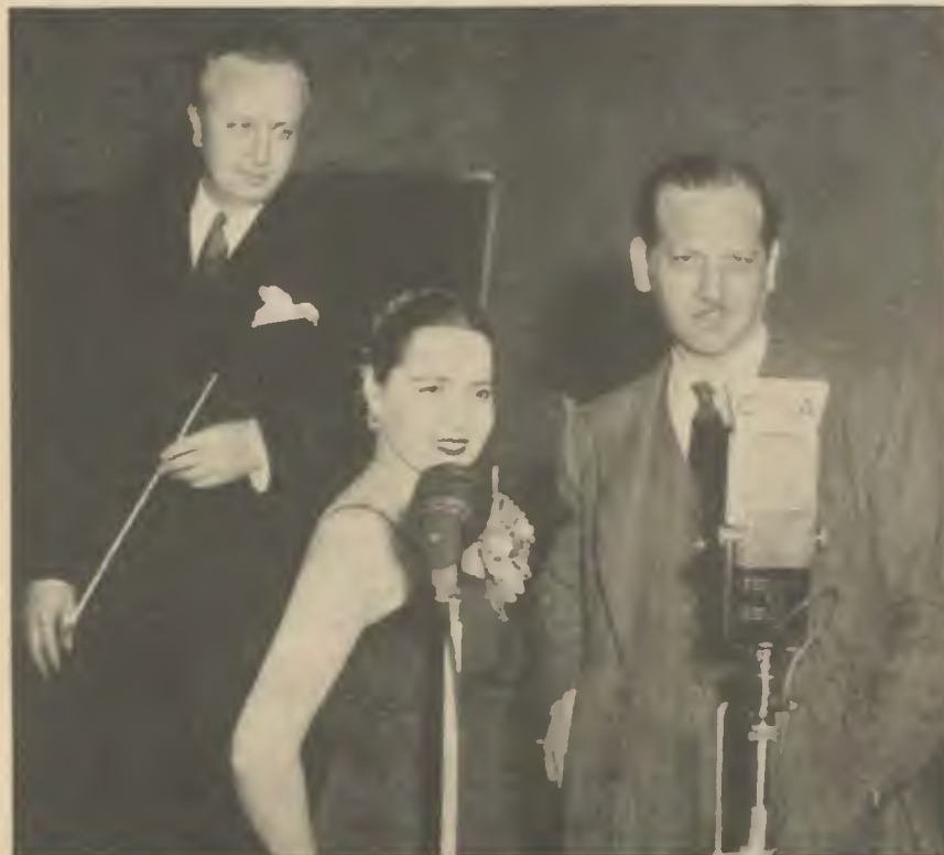
GREETINGS to our southern neighbors as a part of the special dedicatory program celebrating the opening of Columbia's new Latin-American network were sent by soprano Bidu Sayao (center) and screen star Melvyn Douglas (r.), as CBS conductor Howard Barlow (l.) looks on from the podium