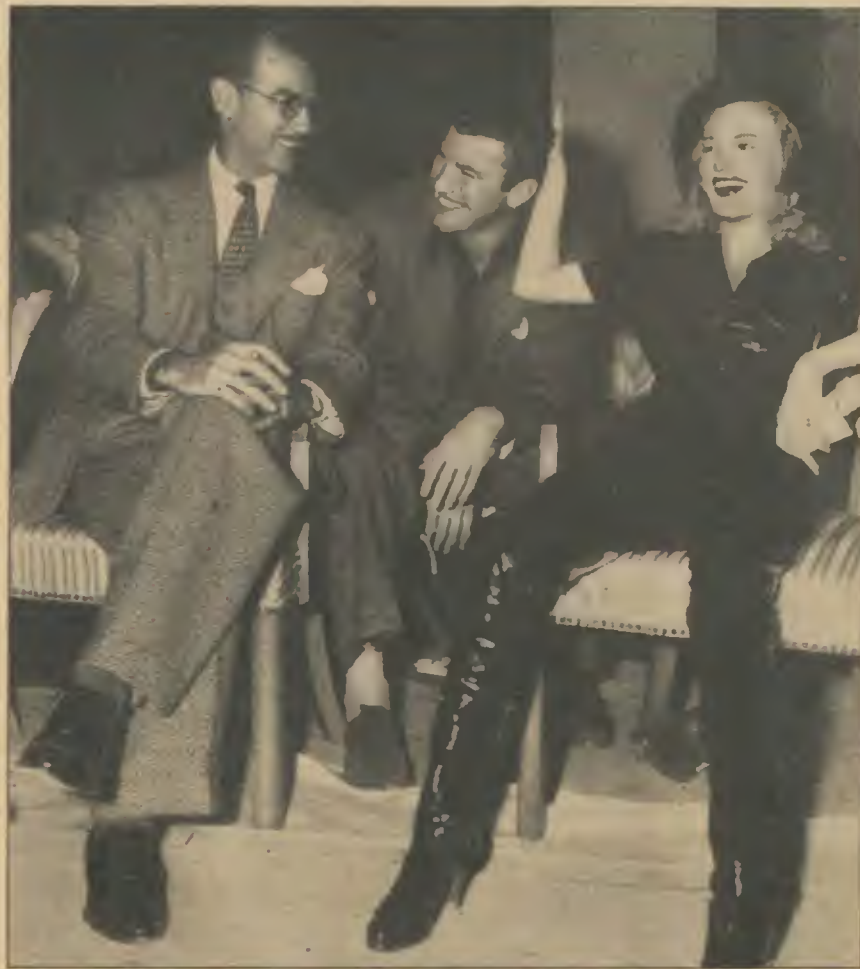
SLINKILY solemn, usually, on the screen, Veronica Lake, top skim of the present glamour-girl cream in Movietown, really cuts loose with a terrific laugh in an off-stage moment on Paramount's "This Gun for Hire." Director Frank Tuttle (left) and Robert Preston join in her merriment