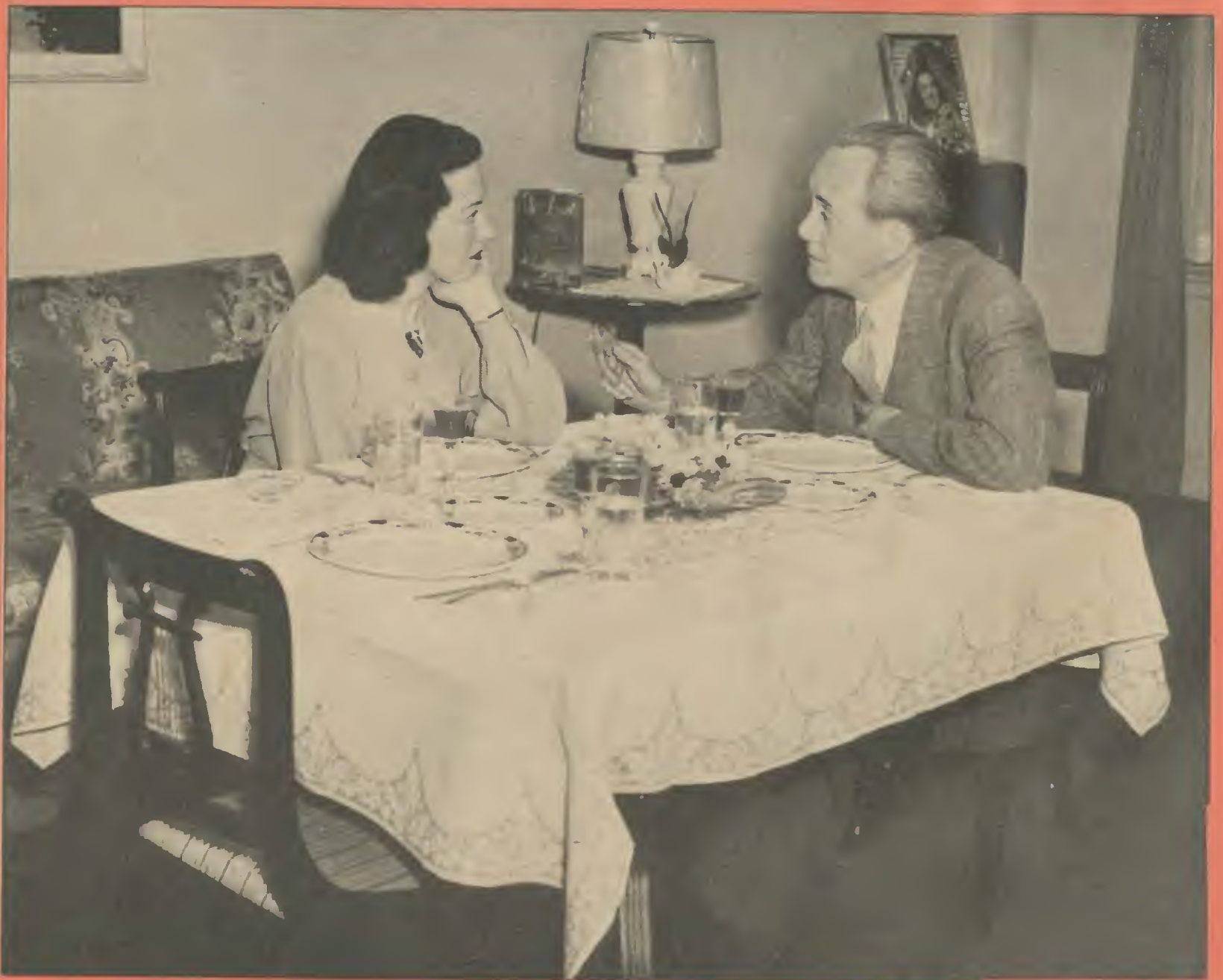
Dr. Joyce gets a surprise when husband Paul brings home a mysterious guest named William Roger Walton, who insists he is her father