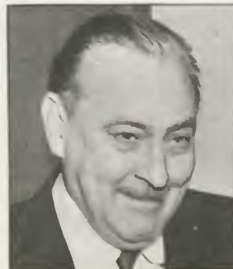
John Barrymore, who answered his last curtain call in Hollywood on May 29

That was an experience and a privilege we shall never forget. For it left us with the thought that, perchance, should the shade of the Bard of Avon have wandered into the studio then, he would have said: "Here is one place where I find no old abusing of my patience and the King's English."—Ed.