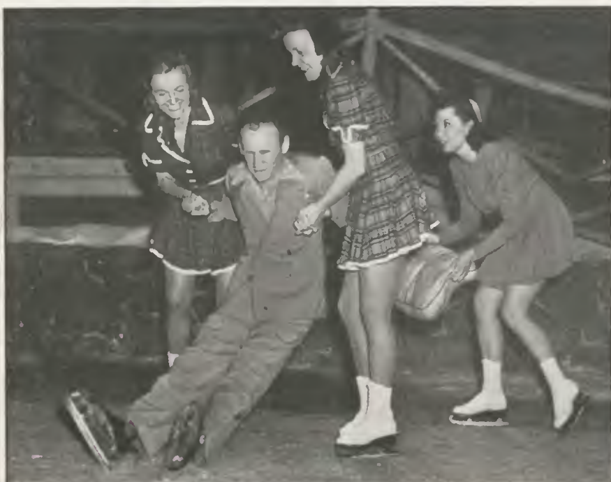
WHEN La Henie gives up, chorines take over with the aid of a pillow

K ING of Sway and Swing, and conceded authority on the sort of music women like, Sammy Kaye, whose orchestra is making its feature-picture debut with Sonja Henie in the 20th Century-Fox film "Iceland," had a tough time trying to skate, finally gave it up as a bad job. Fact of the matter was, Sammy continued to fall—notwithstanding! Even the incomparable Henie, who offered to teach him the art, despaired. After that Jack Oakie and Osa Massen, also featured in the movie, attempted to give Sammy a whirl around the "Iceland" carnival rink set. But they failed, too. Said Sammy dolefully, "I'm giving up skating. From now on, I'll take my downbeats in swing and leave the skating in 'Iceland' to Sonja Henie."