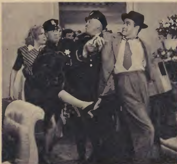
A SWIFT KICK where it does Hope the most good is one of the humor highlights of the film. "My Favorite Blonde" is a riotous spy story