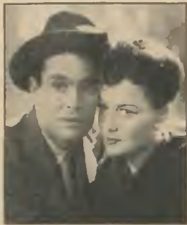
HENRY FONDA and Olivia de Havilland show fans how professors love and live in "The Male Animal"

ADVENTURES OF MARTIN EDEN (VVV): Glenn Ford, Evelyn Keyes in salty tale of hell-ship mutiny.—Family.