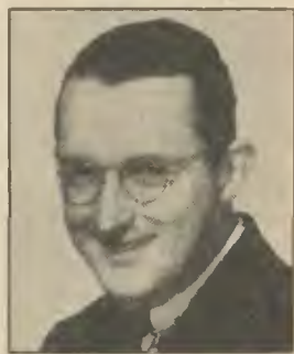
Tommy Dorsey —Takes over Red Skelton's spot

Eastern 2:45 p.m. Mountain 12:45 p.m. Central 1:45 p.m. Pacific 11:45 a.m.