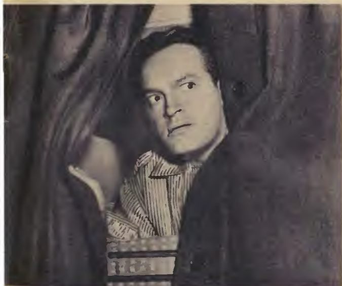
CURRENT Hope picture is "My Favorite Blonde," with Madeleine Carroll—whom millions of radio fans know as his secret passion!