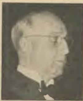
Promotion of goodwill through CBS' Latin American net pointed out by President Manuel Prado of Peru in speech

EWT City Program Station 4 a.m.—Tokyo—News (English). JZL (17.785) JZJ (11.80) 7:25 a.m.—Melbourne—Broadcast for eastern North American listeners: VLG2 (9.54) 7:35 a.m.—Chungking—Chinese National program for North America; 8:30, 10, 11 a.m.—News (English): XGOY (9.635) 7:40 a.m.—Moscow—English program for North America: (15.265, 15.18, 11.885, 9.566) 7:40 & 11:15 a.m.—Melbourne—Messages to home from American soldiers in Australia: VLG2 (9.54) 11 a.m.—Melbourne—Transmission for western North America: VLG2 (9.54) VLG2 (11.87) 1 p.m.—Rome—North American Hour: 2R06 (15.30) 1:45 p.m.—Guatemala—Popular marimba music for North America: TGWA (15.17) 1:45 p.m.—Athlone, Ireland—News (English): (17.84) 5:15 p.m. (ex. Sat., Sun.)—Boston—Friendship Bridge: WRUL (11.79, 9.70) 5:50 p.m.—Berlin—Germany's program for North America: DJD (11.77) DJB (15.20) DNL2 (11.74) DNL7 (11.885) DNL24 (9.62) DZD (10.54) DNL7 (7.24)