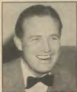
Horace Heidt —"Treasure Chest" Tuesdays

GOOD-WILLING air show, "Down Mexico Way" takes in more territory. Renamed "Pan-American Holiday," it starts a 21-week tour of our sister republic