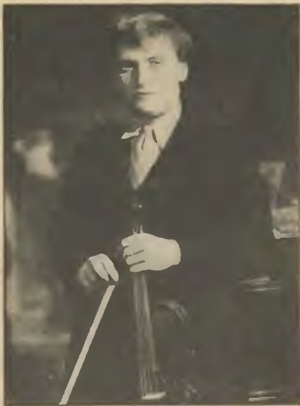
YEHUDI (above) and sister Hephzibah Menuhin offer a rare duet treat in a new Victor recording of Schubert's Rondo in B Minor