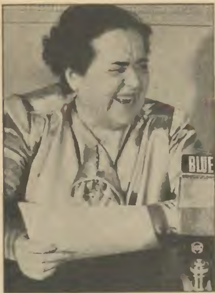
ELSA MAXWELL , Blue "Party Liner," believes the cure for war jitters is laughs and more laughs. She takes her own medicine

China's First Lady Honored; Dorsey Replaces Red; Von Papen Exposed