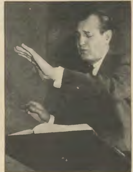
CONDUCTOR Alfred Wallenstein's final offering on MBS' "American Opera Festival" will be a Deems Taylor composition