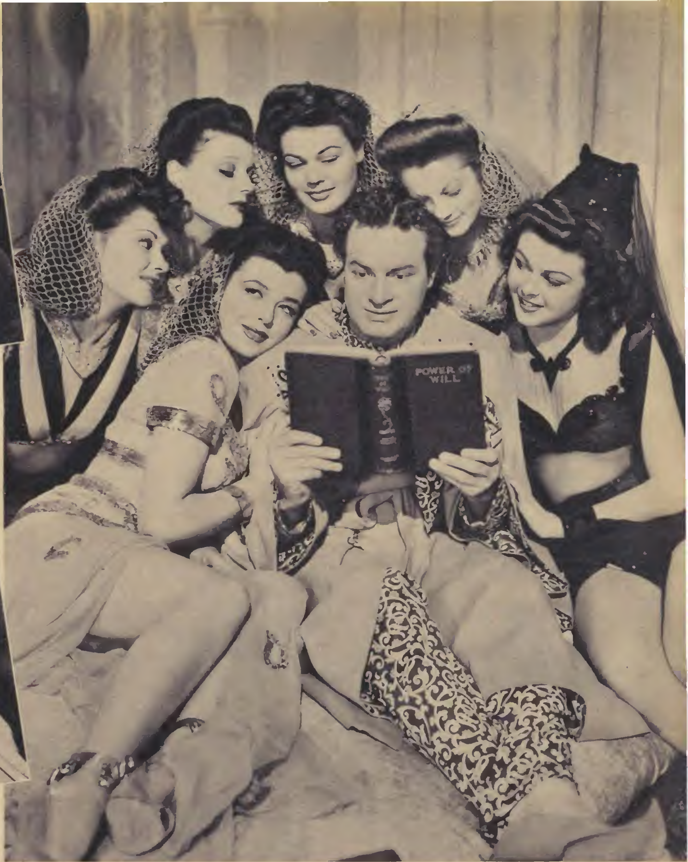
ON THE "Road to Morocco" Hope meets many adventures and temptations—including this sextet of Moroccan maidens. The scene may prove that mind cannot lose to matter when there isn't any mind