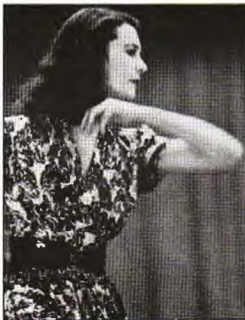
VIVIEN LEIGH, absorbed in her role, rehearses "Screen Guild Theater" appearance October 13