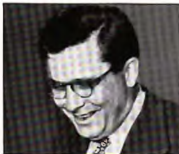
LISTENERS know Candidate Wendell Willkie and his views from his campaign before microphones

THREE days crowded with words and facts and figures lie between us and the election of a President. Our wisest men tell us that the world is at a crossroads today and that our ballots can send it down the avenue marked Peace, or up that other one named Perdition.