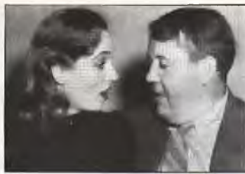
CAROLE LOMBARD forsakes comedy to portray the tragic bride of Laughton in same film