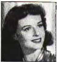
Mrs. Charlie Chaplin

OFFICIAL confirmation of what Hollywood already knew came October 16, when Charlie Chaplin introduced Paulette Goddard as his wife at the New York premiere of "The Great Dictator" . . . Olivia de Havilland and James Stewart are at it again; he is teaching her to fly . . . Dennis O'Keefe and Steffi Duna staged their expected elopement