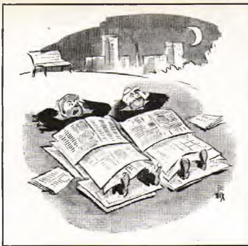
"Quit worrying . . . the radio will never take the place of the newspaper!"