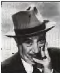
HUGH HERBERT'S zany carryings-on highlight the "Hit Parade of 1941"

W HEN "Hit Parade of 1941" was made the producers took a lot of talented people and put them all together doing what they could do best, and the result is a lively, entertaining piece of musical comedy built around a flimsy story, with gag situations and well-delivered songs to put it over.