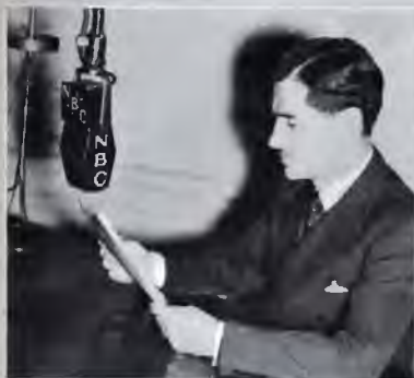
RADIO saluted Lowell Thomas' tenth radio anniversary at the Waldorf with a dinner broadcast

Dean of commentators feted by colleagues!