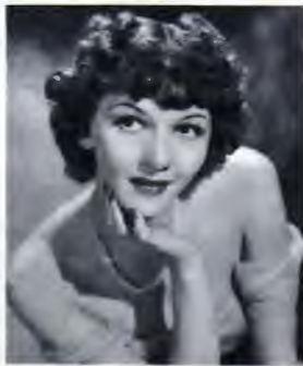
MARY MARTIN, singing star of stage and screen