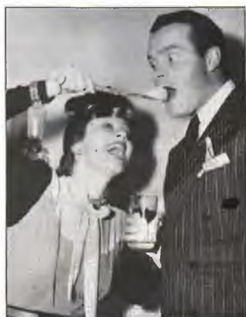
BOB HOPE helps Irene Rich eat birthday cake at surprise press party following her show Oct. 13