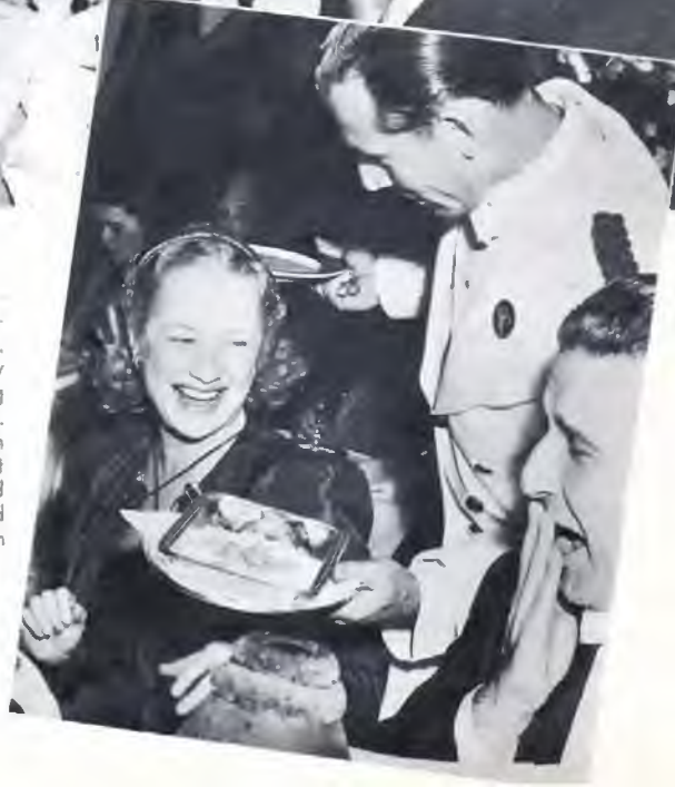
RIGHT: Seldom-photographed Miriam Hopkins, caught in a gay mood while dining at Ciro's recently. Blase gentleman barely seen at right of picture could not be identified by the cameraman