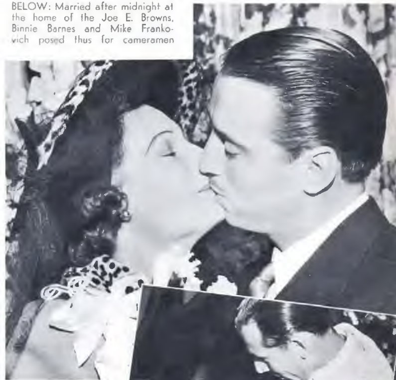
BELOW: Married after midnight at the home of the Joe E. Browns, Binnie Barnes and Mike Frankovich posed thus for cameramen