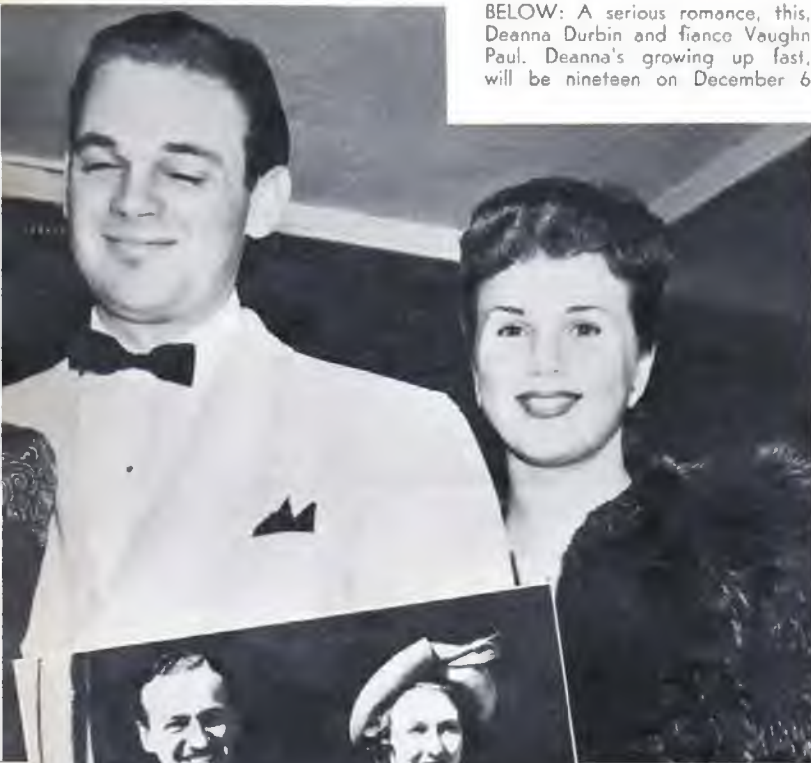
BELOW: A serious romance, this, Deanna Durbin and fiance Vaughn Paul. Deanna's growing up fast, will be nineteen on December 6