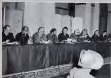
NINE FAMOUS COLLEAGUES, from all networks, gathered to pay homage to pioneer leader