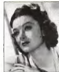
MYRNA LOY, in "Third Finger, Left Hand," teams with Melvyn Douglas

WHAT THEY THOUGHT OF IT: "Hollywood Reporter: "One of the comedy joys of the season..." Variety: "Pleasantly and hilariously mad entertainment." Los Angeles Times: "Third Finger, Left Hand" will do nicely."