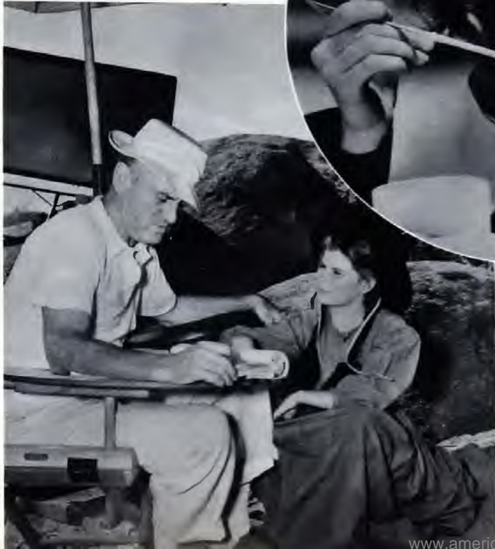
LEFT: Betty with her discoverer, director Sam Wood. She called him "Li'l Abner," he called her his "oomph girl" during the filming of the picture "Rangers of Fortune"