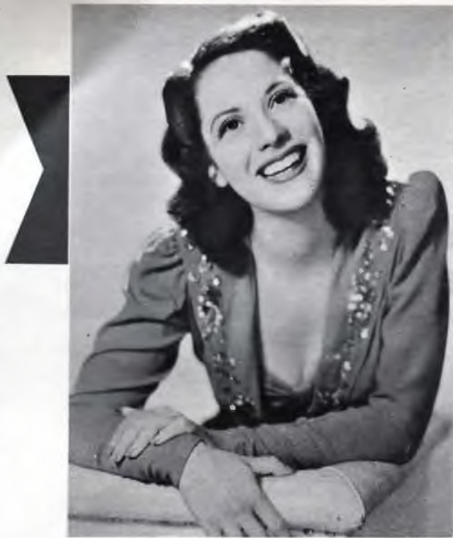
—Bruno of Hollywood

8:00 p.m. EST — 7:00 p.m. CST 6:00 p.m. MST — 5:00 p.m. PST