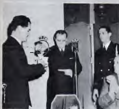
HIS FIRST MIKE, gold-plated, is presented by NBC's Niles Trammell. Gabriel Heatter, right