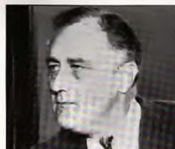
LISTENERS will also hear Candidate Roosevelt's eleven-hour plea. Then they'll pick a President