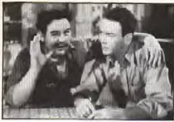
CHARLES LAUGHTON, William Gargan in the Pulitzer-prize play "They Knew What They Wanted"