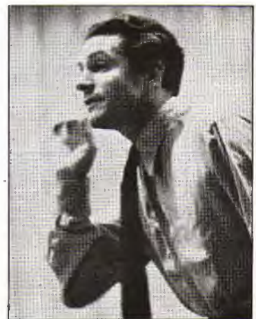
LAURENCE OLIVIER, opposite Vivien, awaits cue. The famous pair did Coward's "Private Lives"