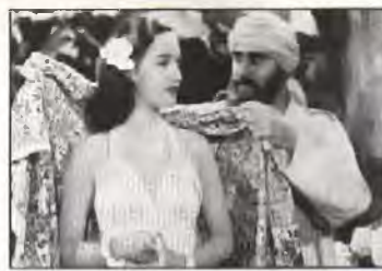
DOROTHY LAMOUR, in "Moon Over Burma," has the role of a Brooklyn showgirl stranded in India