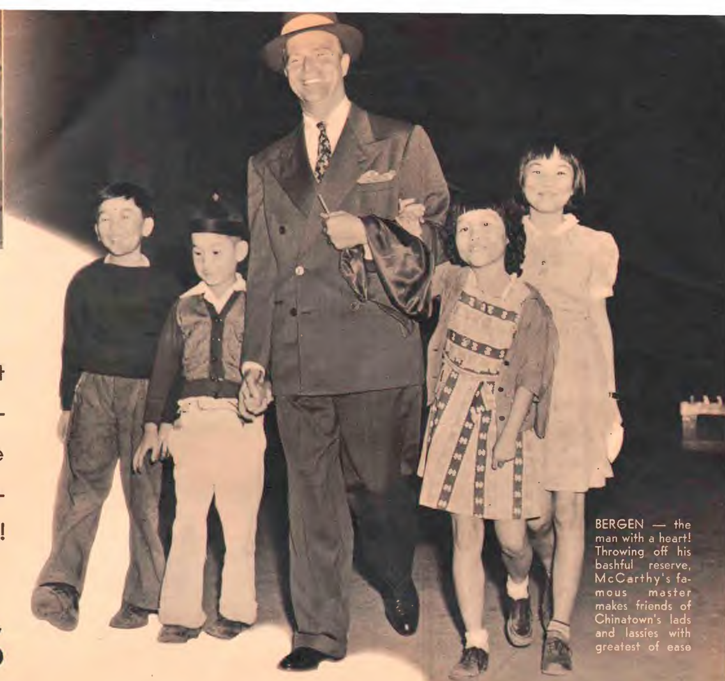
BERGEN — the man with a heart! Throwing off his bashful reserve, McCarthy's famous master makes friends of Chinatown's lads and lassies with greatest of ease