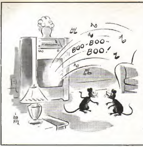
"You can have Bing Crosby . . . I like Ken Carpenter's cheese commercials myself!"

12:45 ★NBC-News; Markets; Weather: WEAF CBS-Our Gal Sunday, sketch: WABC WEEL WORC WDRC WOKO WPRO WCAU ★News: WCOP WLAW WSAR WNBF Singing Sam: WTIC WJAR WTAG ★KYW-News; Repub. Campaign Comm. WATR-Pleasure & Profit WBRK-Serenade for Strings WBYR-Wax-Wise WELI-Weather; Organ Echoes WILAI-Noonday Revue