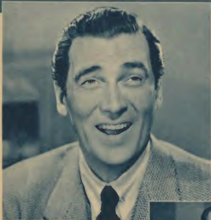
WALTER PIDGEON (above) wins this month's Movie and Radio Guide Award for Distinguished Acting as judged by Hollywood's commentator-columnist, Jimmie Fidler (right), for deft handling of a difficult assignment in Universal's "It's a Date"