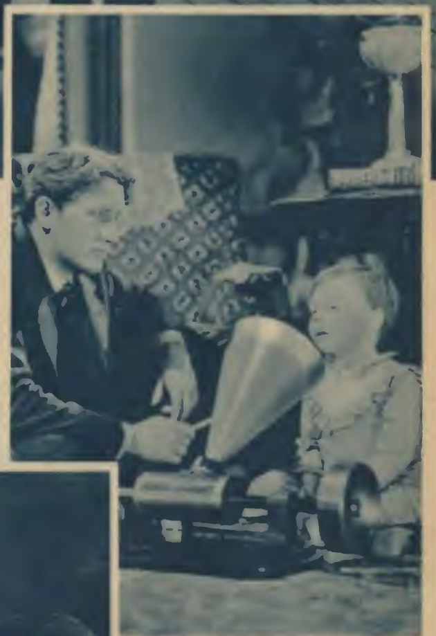
RIGHT: The young telegrapher's experiments with sound led to his invention of the phonograph about 1890. Even then he was experimenting with talking motion pictures, and modern sound cameras are based upon his work