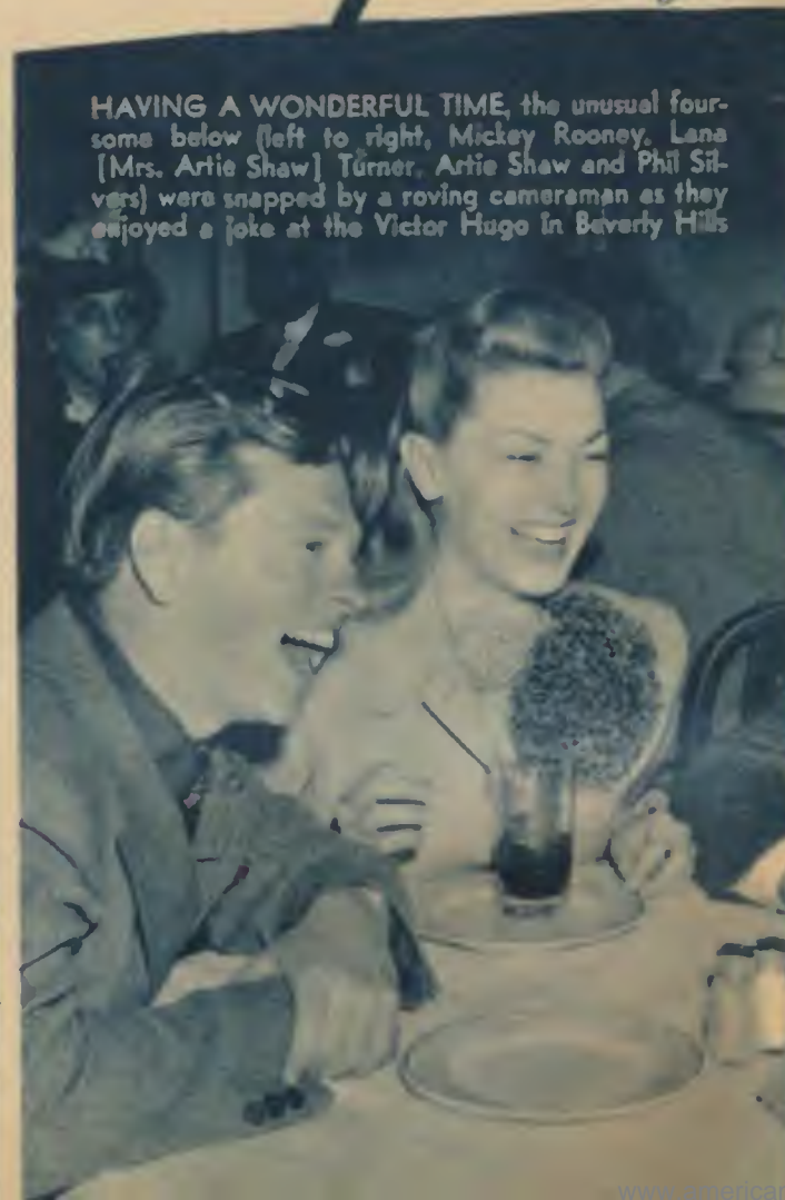
HAVING A WONDERFUL TIME, the unusual foursome below (left to right, Mickey Rooney, Lana [Mrs. Artie Shaw] Turner, Artie Shaw and Phil Silvers) were snapped by a roving cameraman as they enjoyed a joke at the Victor Hugo in Beverly Hills