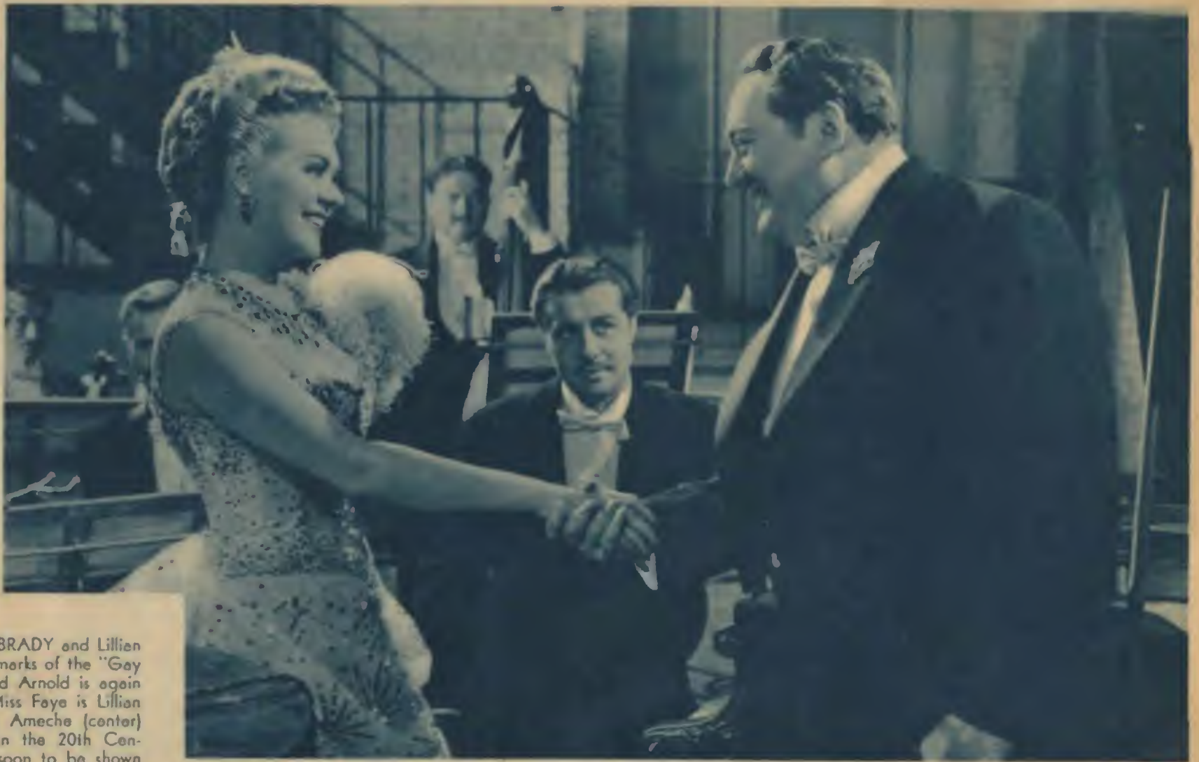
DIAMOND JIM BRADY and Lillian Russell were landmarks of the "Gay Nineties." Edward Arnold is again seen as Brady; Miss Faye is Lillian Russell, and Don Ameche (center) is her husband in the 20th Century-Fox picture soon to be shown

she loved—who would have broken her heart had it been less deep, less great.