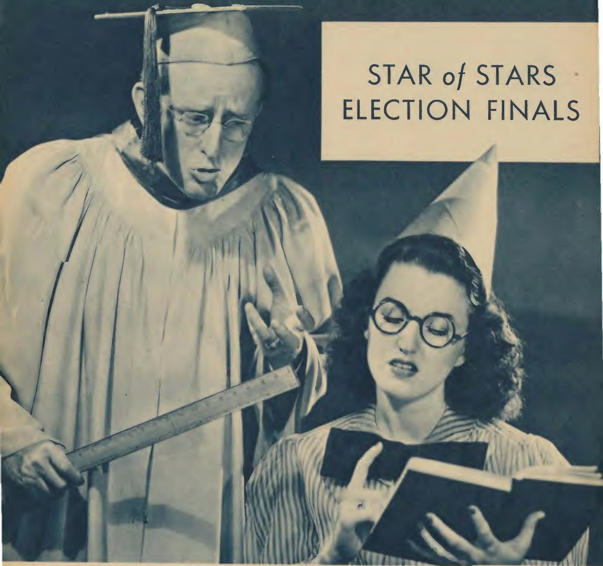
Kay Kyser and Ginny Simms

H EREWITH is presented the third and final group of 1940 Star of Stars election results. The results included present material as interesting for observation as either of the two preceding groups, both from the point of view of trends in listener performance and of indications of star and program popularity. Interesting, for example, is the showing of Kay Kyser, who, with his Ginny Simms, walked off with nearly half of the votes cast in the Audience Participation division, and that with such money-giving opponents as "Dr. I. Q.," "Information, Please," and "Battle of the Sexes."