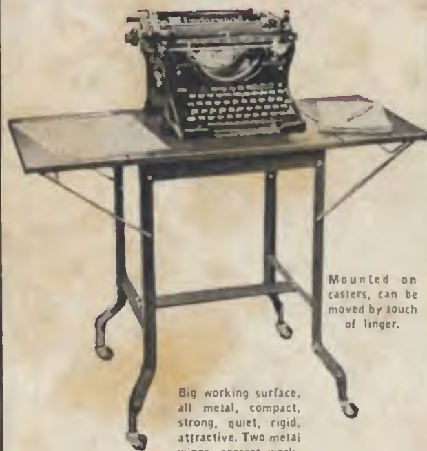
Mounted on casters, can be moved by touch of finger.