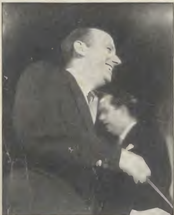
MAESTRO TED WEEMS, as an interested bystander, watches race for the "kitty" made up of half-dollars forfeited by members who answer the audience's questions incorrectly

Dear Sirs, Having heard and immensely enjoyed Ted Weems' "Beat the Band" wizards, I'd like to see pictures of them. Won't you print some? W., Miami, Fla.