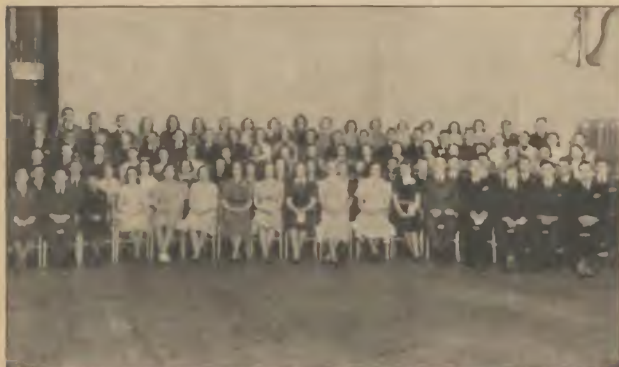
The Greenfield Village Choir of Edison Institute Schools, Dearborn, Michigan, will be heard on the "Ford Sunday Evening Hour" (CBS) this week. Pictured here, this group is one of Mr. Ford's many cultural interests.

Eastern Daylight 8:30 p.m. Central Daylight 7:30 p.m. Mountain 5:30 p.m. Eastern Standard 7:30 p.m. Central Standard 6:30 p.m. Pacific 4:30 p.m.