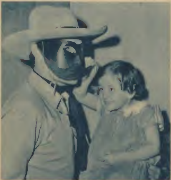
The Lone Ranger