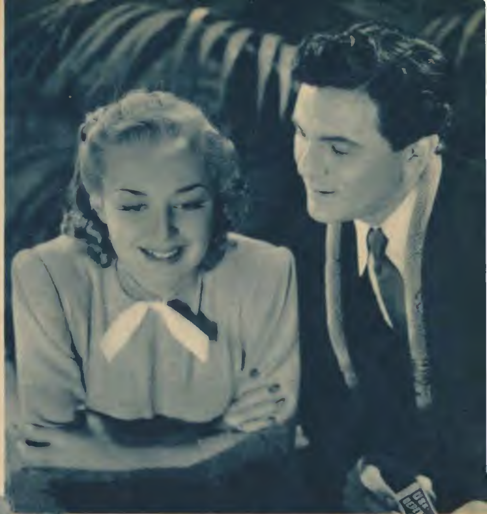
"SATURDAY'S CHILDREN"—The absorbing and very human story of the marital problems which beset youth of today is nicely told here with John Garfield as the boy and Anne Shirley as the girl involved