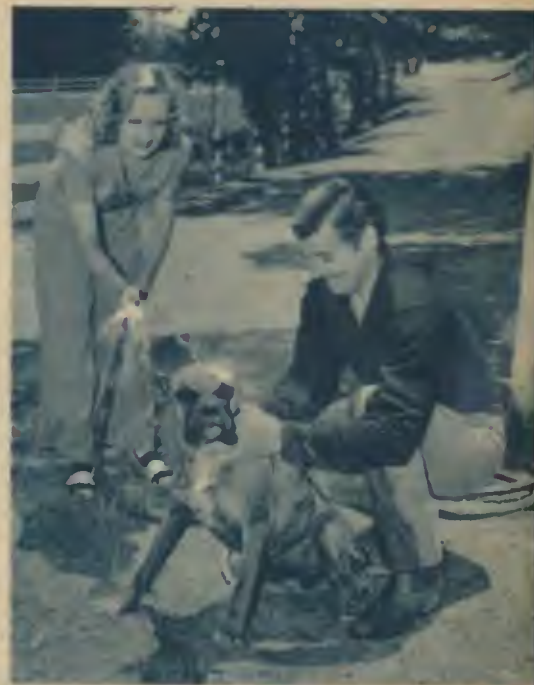
A BATH FOR TUFFY—The Gables have no swimming-pool on their farm yet and Tuffy, the boxer bull, takes his bath via the garden hose