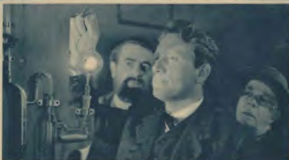
ABOVE: Edison's first real recognition as an inventor and his first great financial reward for his work came when he improved the stock-ticker. Payment for this work enabled him to build his Menlo Park lab, to start work on other and greater inventions.