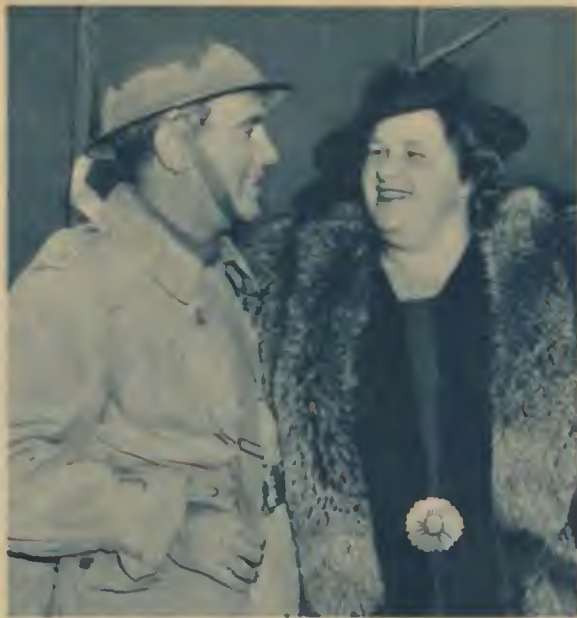
Pat O'Brien and Kate Smith