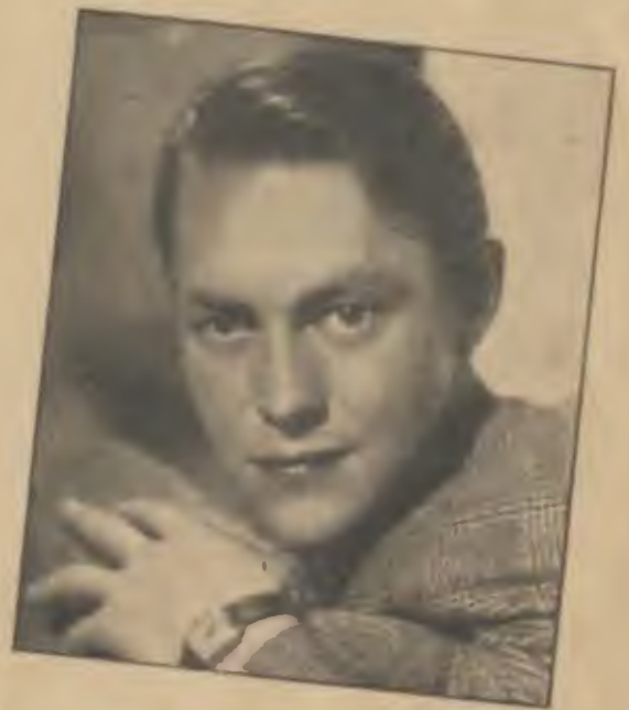
KIT MARSHALL (played by Richard Cromwell), Kathy's twin brother, helped her over many rough spots. He was beloved by Elaine Dascombe when the serial was taken off the air →