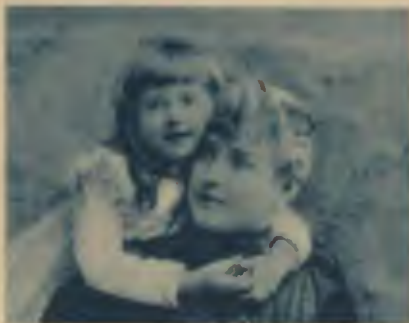
LILLIAN RUSSELL is shown here with daughter (writer of this letter)