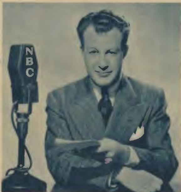
Clifton Fadiman "Information, Please" emcee