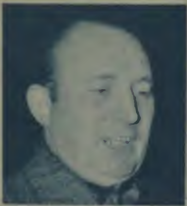
Robert L. Ripley