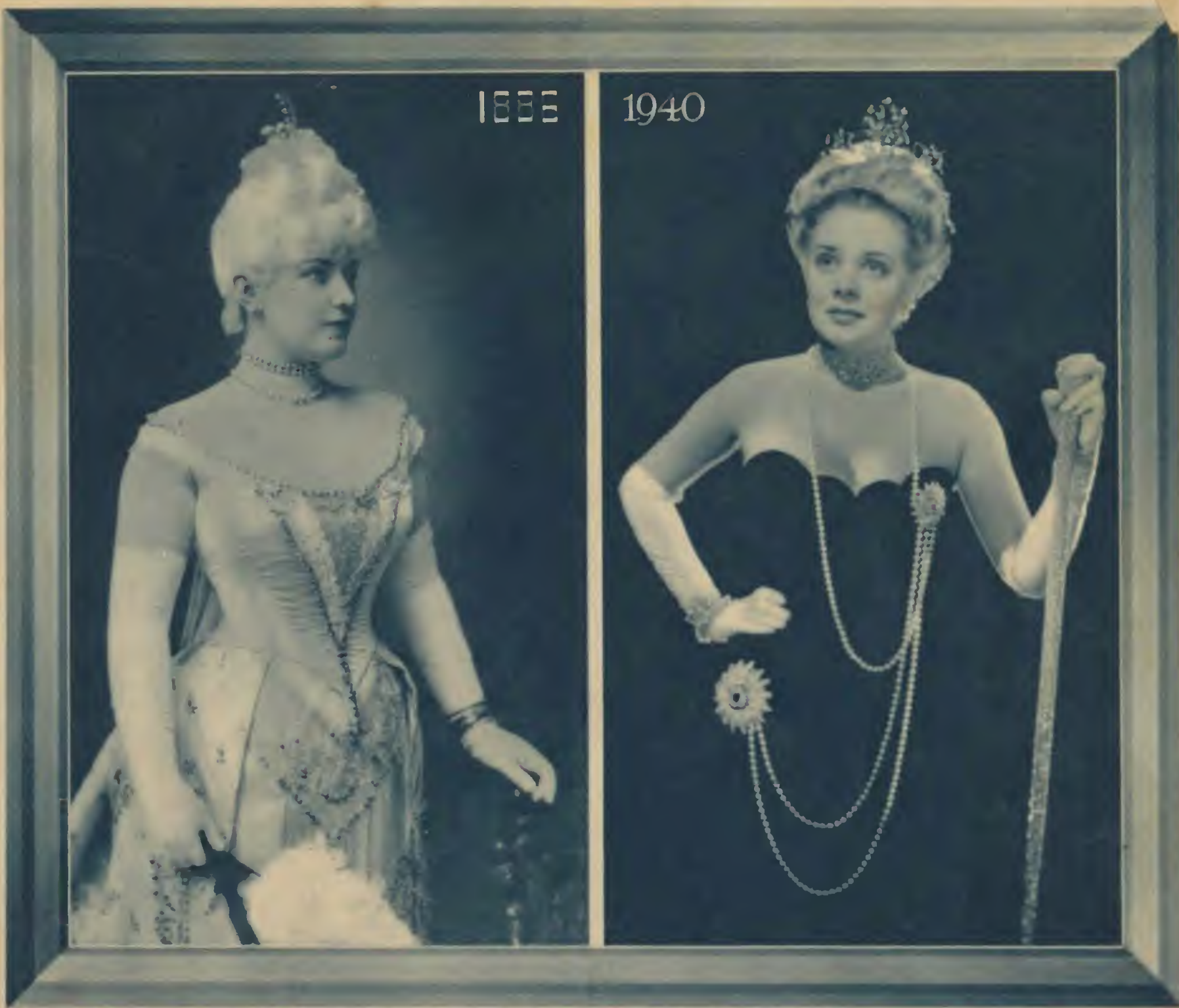
LILLIAN RUSSELL IS AN AMERICAN LEGEND. But more than that, she was a human being who lived, loved and suffered behind a mask of gaiety. It is of this Lillian Russell her daughter tells. Left: Lillian Russell. Right: Alice Faye as Lillian Russell in film