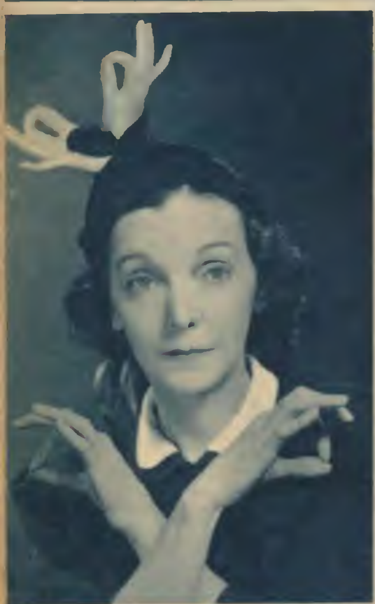
HANDS AND A HAT—Zasu Pitts has scored in radio as Aunt Marnie Wayne on "Big Sister" (CBS serial)

SEE PAGE 17 FOR NEWS OF THIS WEEK'S IMPORTANT PROGRAMS AND GUESTS