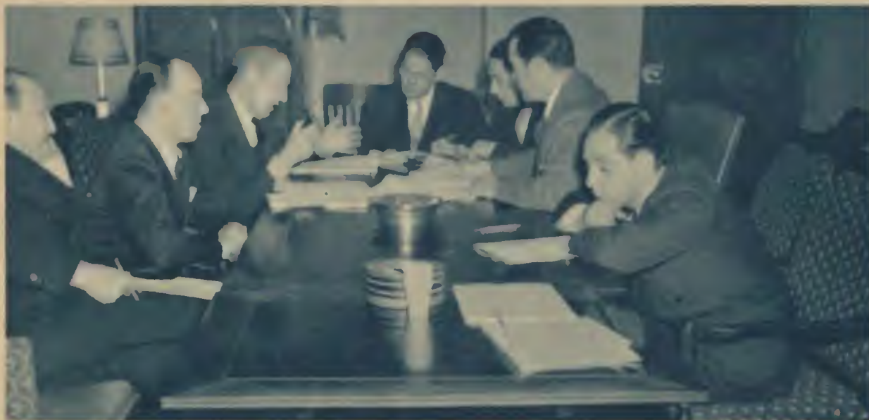
CONSIDERED A DEADHEAD in the production staff, the old-time announcer was allowed to sit in on conferences merely as a courtesy, took no