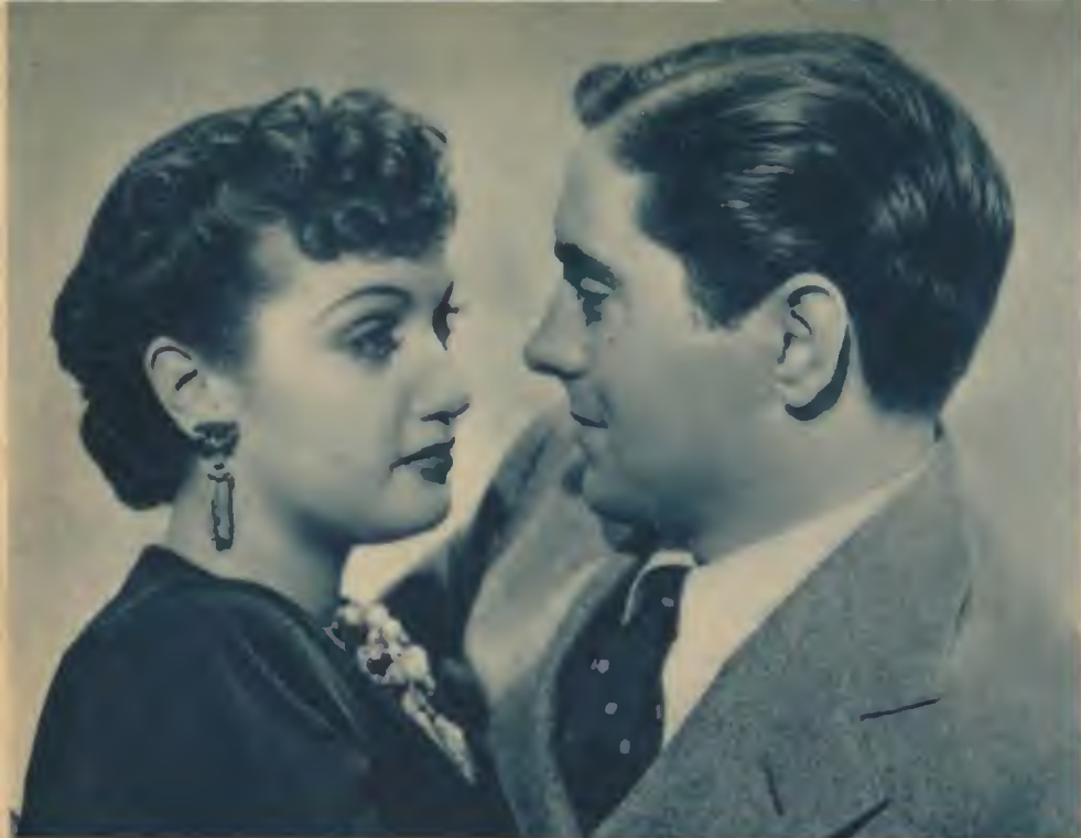
"JOHNNY APOLLO"—Tense and absorbing from its opening scene to its final fadeout, this unusual tale of the underworld gives Dorothy Lamour her first chance at a dramatic role. She is with Ty Power above