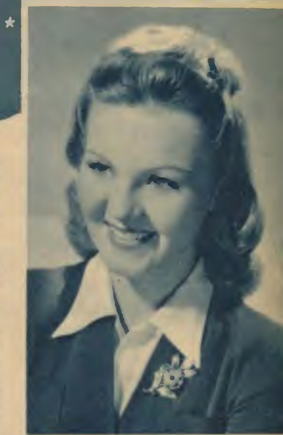
COWBOY GENE AUTRY'S leading lady of films, June Storey, joined him recently on his Sun. CBS radio show

Dick Powell made a big to-do over opening his business block in Loug