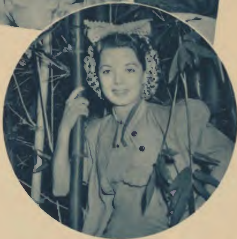
SONGLESS STAR—Frances Langford, "Texaco Theater's" lush singer, does two numbers on the Wed. CBS show, but her latest film role is one in which she doesn't sing. Picture: "Money Isn't Everything"