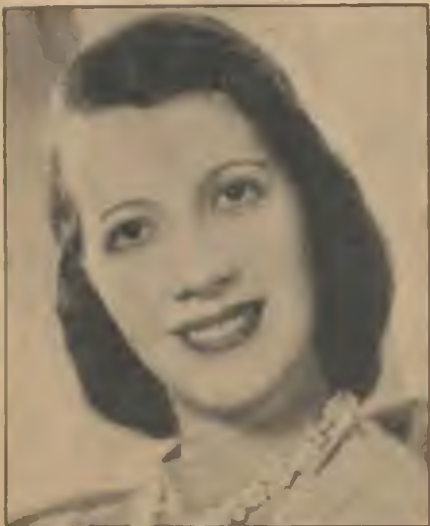
Lily Pons, famed coloratura soprano, will be soloist on a program from N. Y. World's Fair Mon., MBS