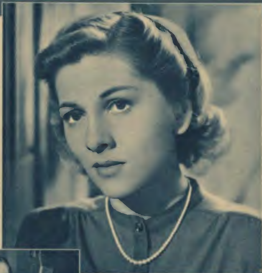
JOAN FONTAINE (above) is Jimmie Fidler's selection as the top feminine performer of the month for her work as Mrs. De Winter in David O. Selznick's "Rebecca." She has been signed to a long-term contract by Selznick, is expected to become a first-rank star