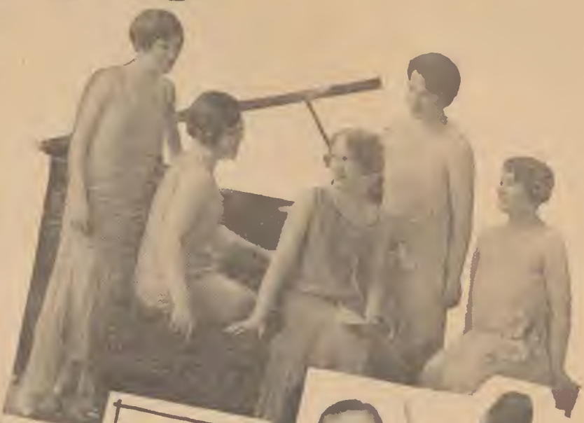
TREBLE CLEFF QUARTET