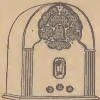
Model LH—7 tube Table Model $49.95 Complete

Each ZENITH and ZENETTE model represents the greatest radio value in its price class