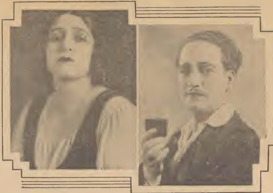
Claudia Muzio and Antonio Corlis, the featured artists in the opera broadcast over the National Broadcasting Company network at 8:00 p. m. on Saturday. They will take the leading roles in the opera "Cavalleria Rusticana." Local outlet WLS.