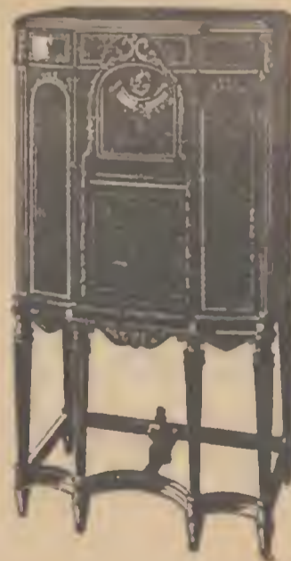
Model 103—14 Tubes $290.00 Complete The "Professional" Radio