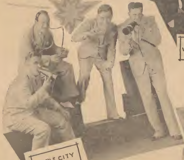
MAPLE CITY 4