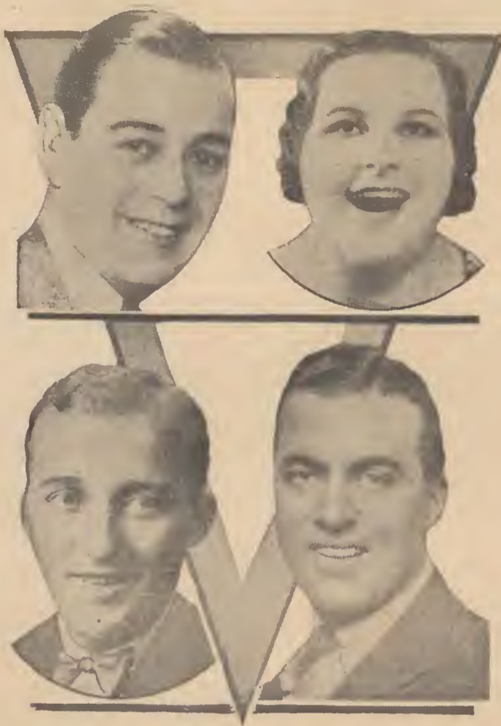
Columbia's Big Four—Morton Downey, Kate Smith, Bing Crosby and Arthur Jarrett

boys who have the ladies in the palms of their lily-white hands. Look at Morton Downey. Exactly twelve months ago the Irish tenor made his inconspicuous debut on the