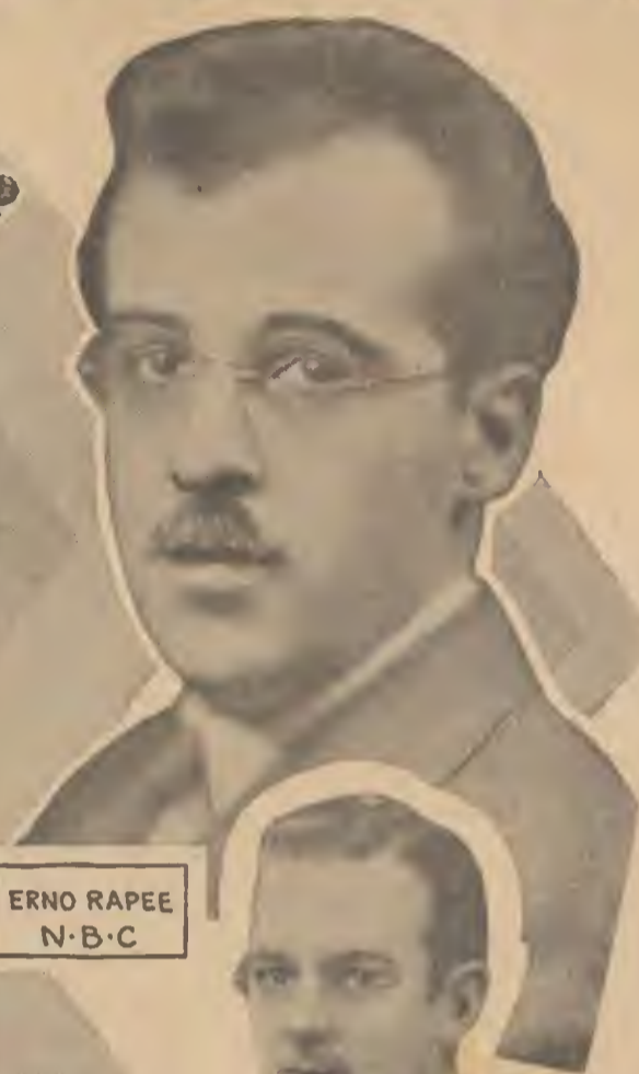
ERNO RAPEE N·B·C