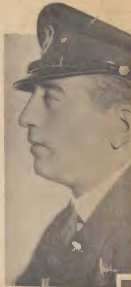
COUNT FELIX VON LUCKNER , erstwhile German Naval Commander, and popularly known as "The Sea Devil," who is now being heard on a new series of programs known as "Adventuring with Count Von Luckner."