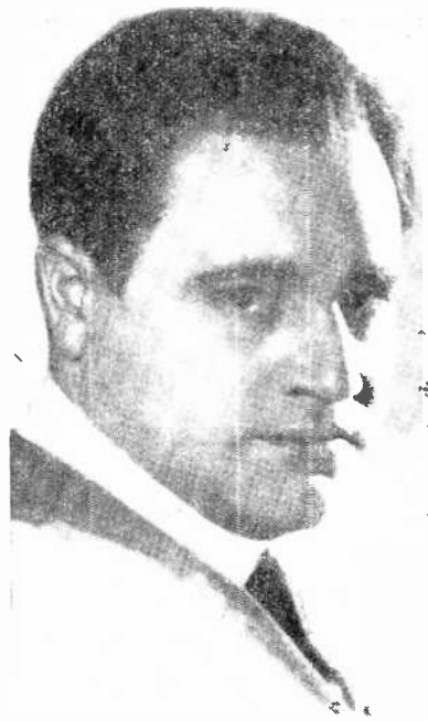
BENIAMINO GIGLI