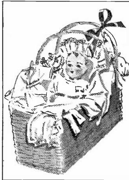
One of our own creations. Baby Doll in basket layette. $4.94

Make this the brightest, merriest Christmas that the children have had in years. Prices are low. A whooping big Christmas, with plenty of presents for everyone, will cost no more than a very meagre Christmas cost two or three years ago.