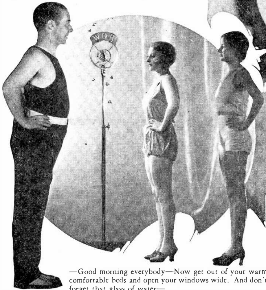
—Good morning everybody—Now get out of your warm comfortable beds and open your windows wide. And don't forget that glass of water—