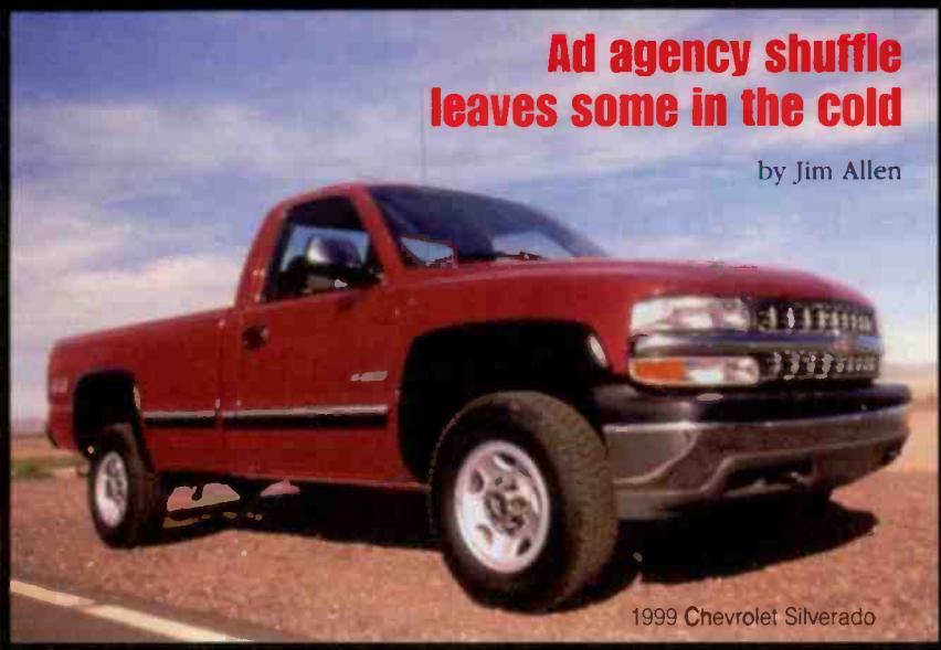
1999 Chevrolet Silverado

Auto industry insiders and radio ad reps say General Motors' (N:GM) recent announcement of a new marketing strategy and a restructuring of its reported $500M-plus annual ad program could mean a "big cash bonanza" for radio this year.