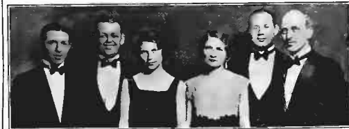
This sextet sings every Sunday at 2 o'clock through WKRC in the Gruen Old Fashioned Garden of Melodies, a program now in its second year as a regular weekly feature.