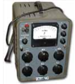
Fluke 801 Differential Voltmeter