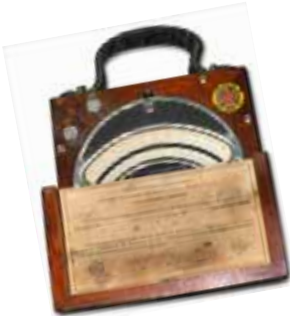
GE DC Ammeter