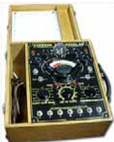
Supreme 85 Tube Tester