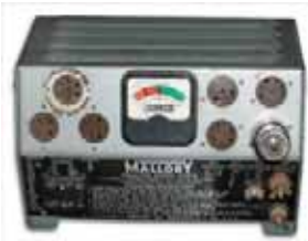
Mallory Vibrator Tester