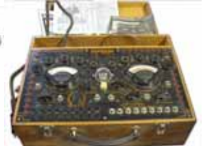
Supreme 385 Automatic Tester