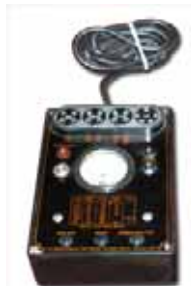
Van Horn - Lewelling Tube Tester