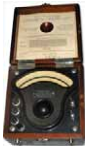
GE Single Phase Wattmeter