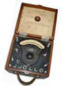
GE Polyphase Wattmeter