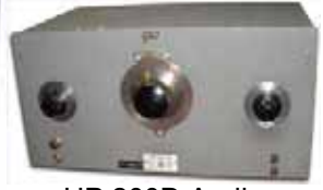
HP 200D Audio Oscillator