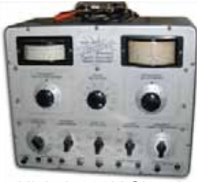
Hickok 288X Signal Generator