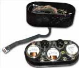
Readrite Model 245 Tube Tester