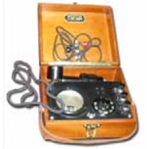
Weston In-circuit Tube Tester