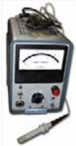
HP Non-contact DC Milli-ammeter

Tube televisions, etc., displayed at the January meeting.