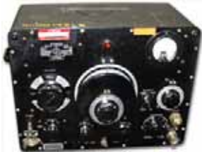
General Radio Signal Generator