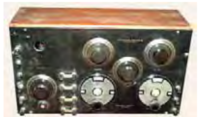
Northwestern Radio Mfg. Co. Unknown