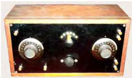
Regen Kit - Dave Brown