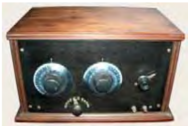
Homebrew or kit