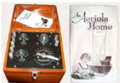
Westinghouse Aeriola & Brochure