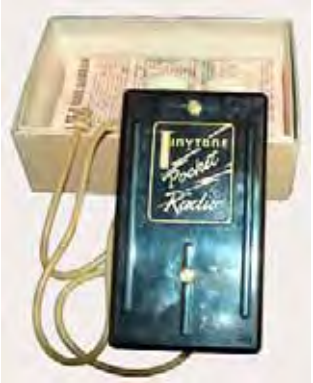
Tinytone Pocket Radio Galen Feight