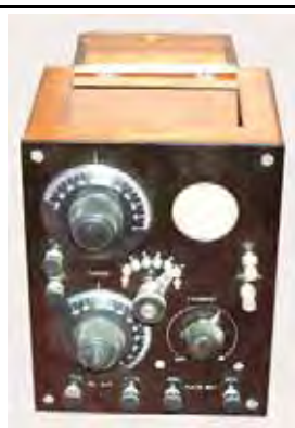
Kilbourne & Clark